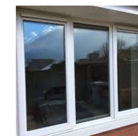
White UPVC Windows and Grey SBD Doors