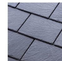
Slate tiles to porch roof