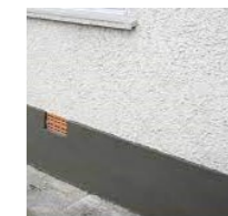
Black rendered plinth