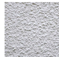
White render to walls