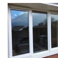
White UPVC Windows and Grey SBD Doors