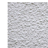
White render to walls