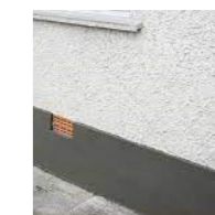
Black rendered plynth