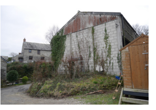
NORTH EAST VIEW