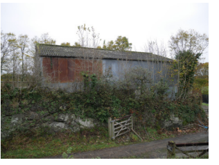
SOUTH EAST VIEW