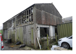
SOUTH WEST-NORTH WEST VIEW