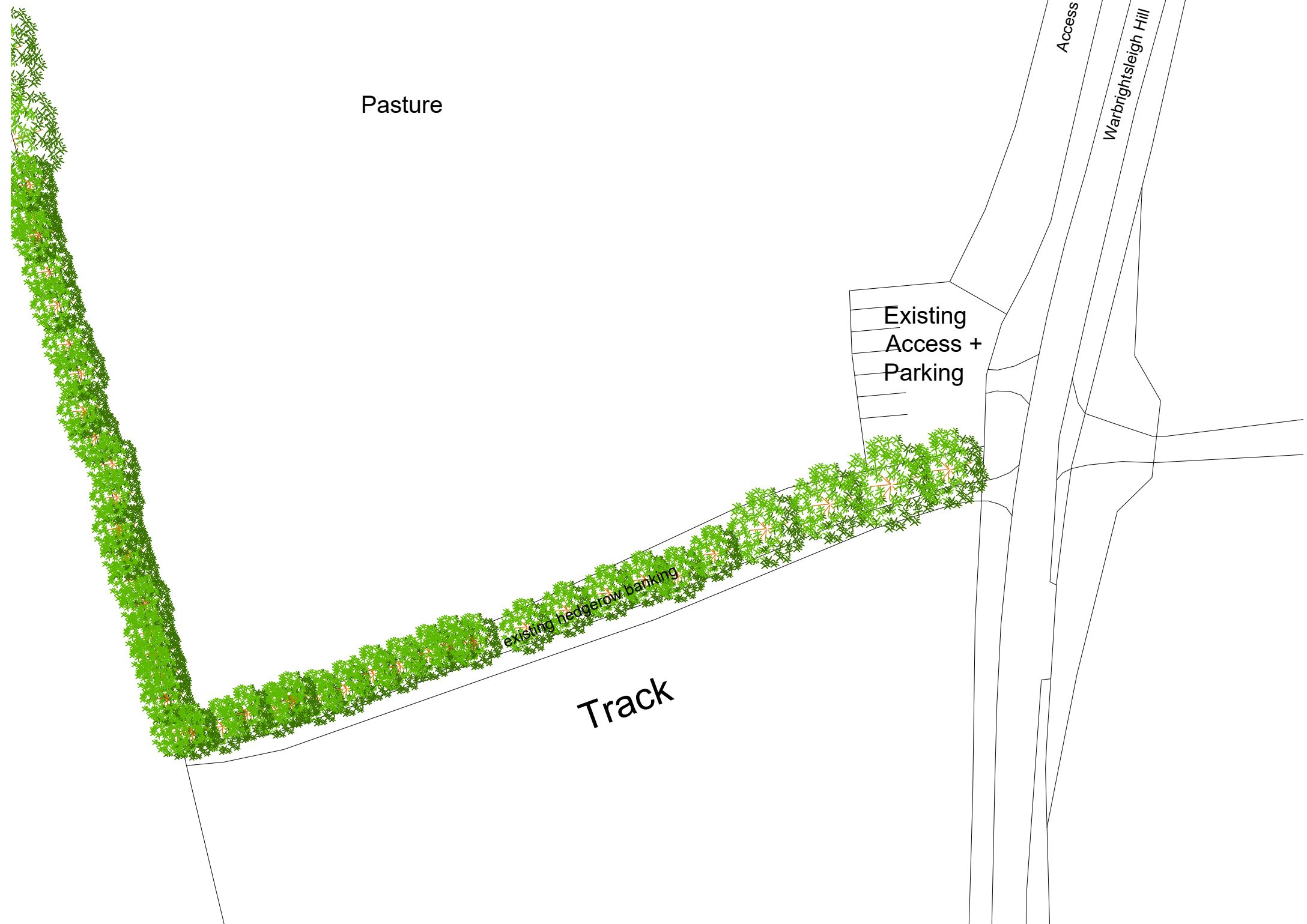
Existing Site Layout