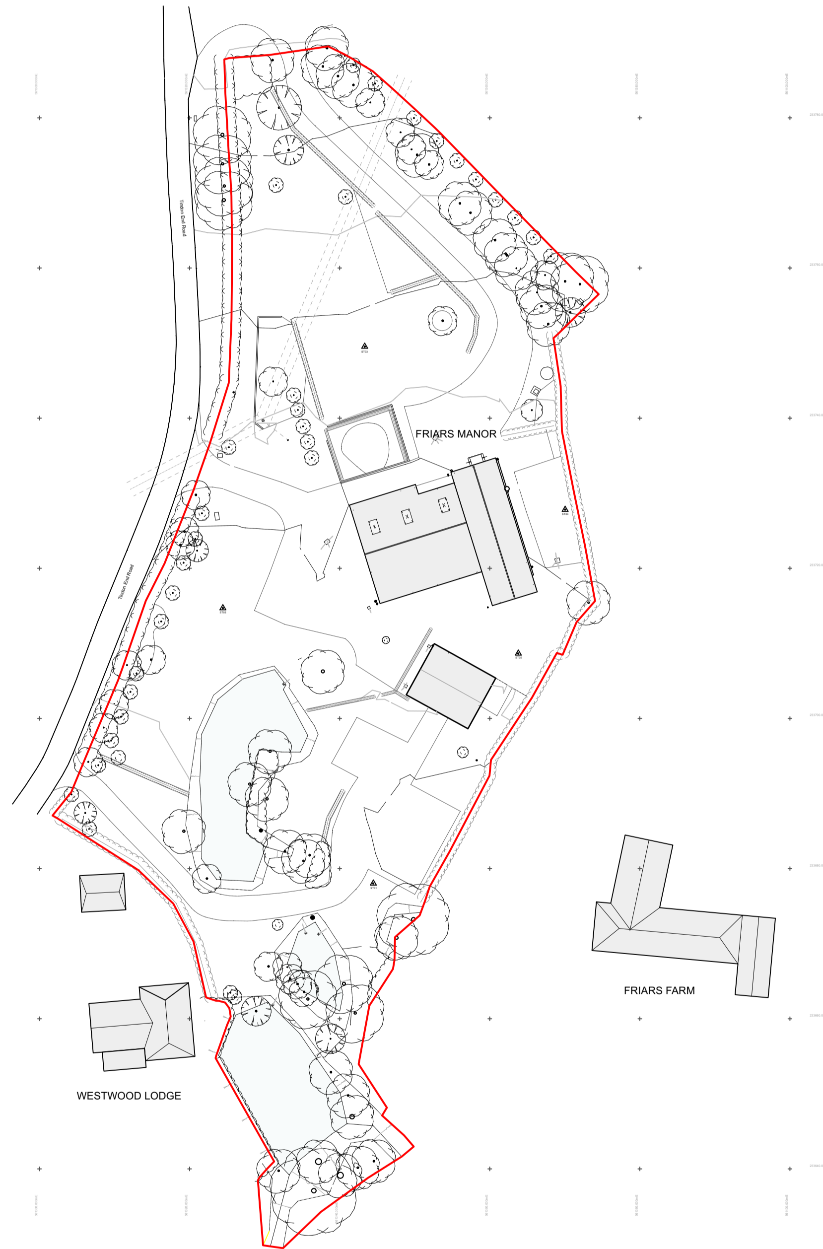
1 EXISTING RED LINE BOUNDARY PLAN Scale: 1:500