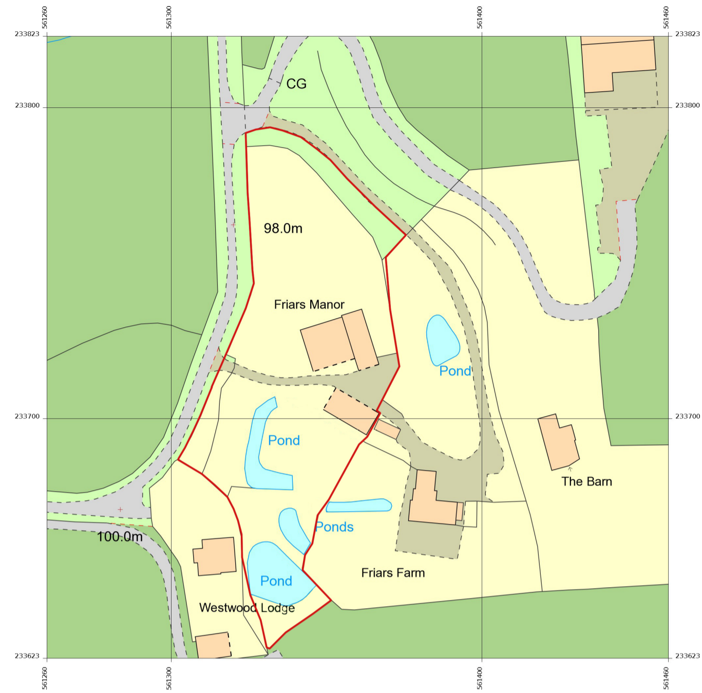
2 EXISTING LOCATION PLAN 1:1250