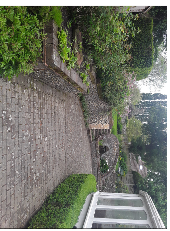
Photograph showing water feature and need for the corner of the extension to be angled.