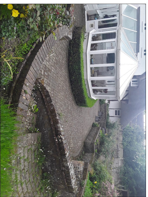
Photograph showing water feature and brick and flint garden walls.