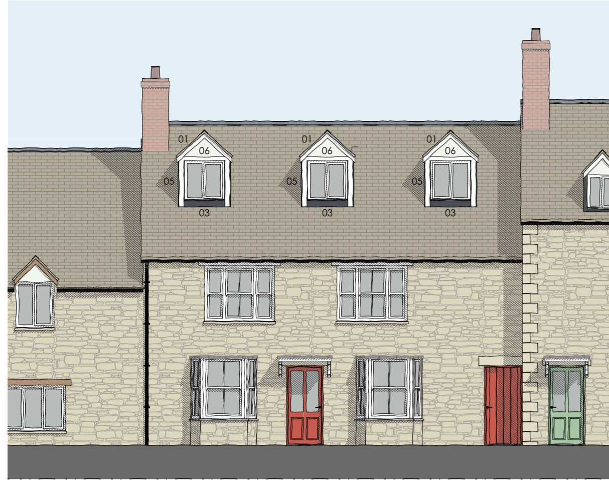
E-01 Elevation 1:100