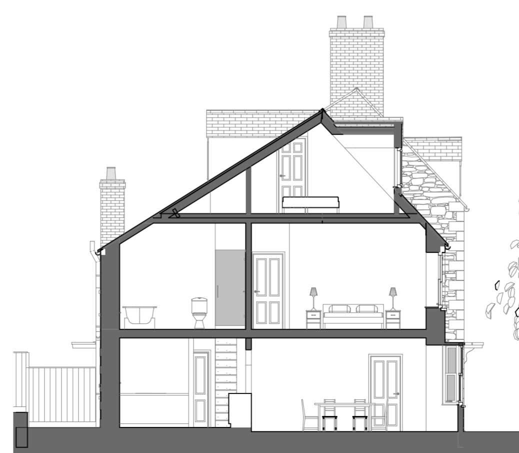
S-01 Building Section 1:100