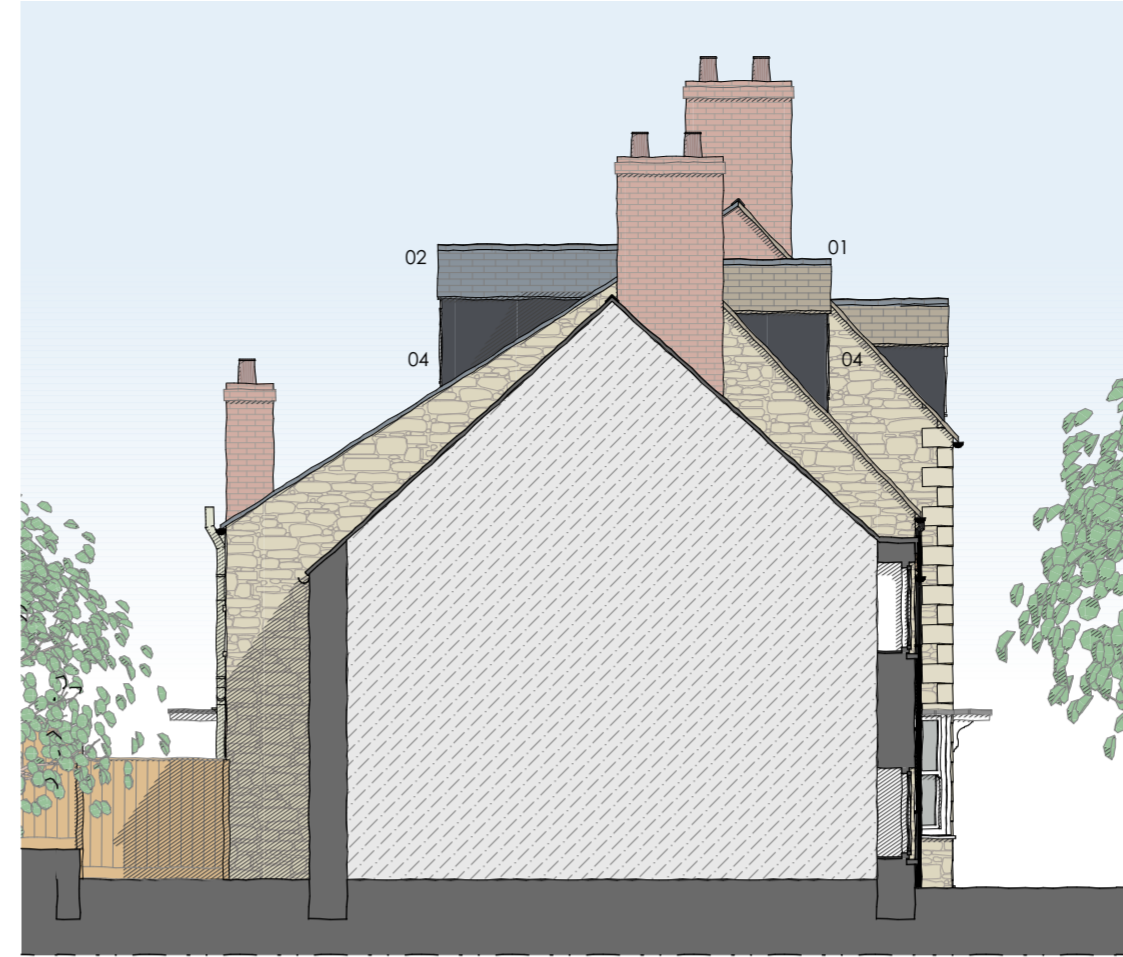
E-02 Elevation 1:100