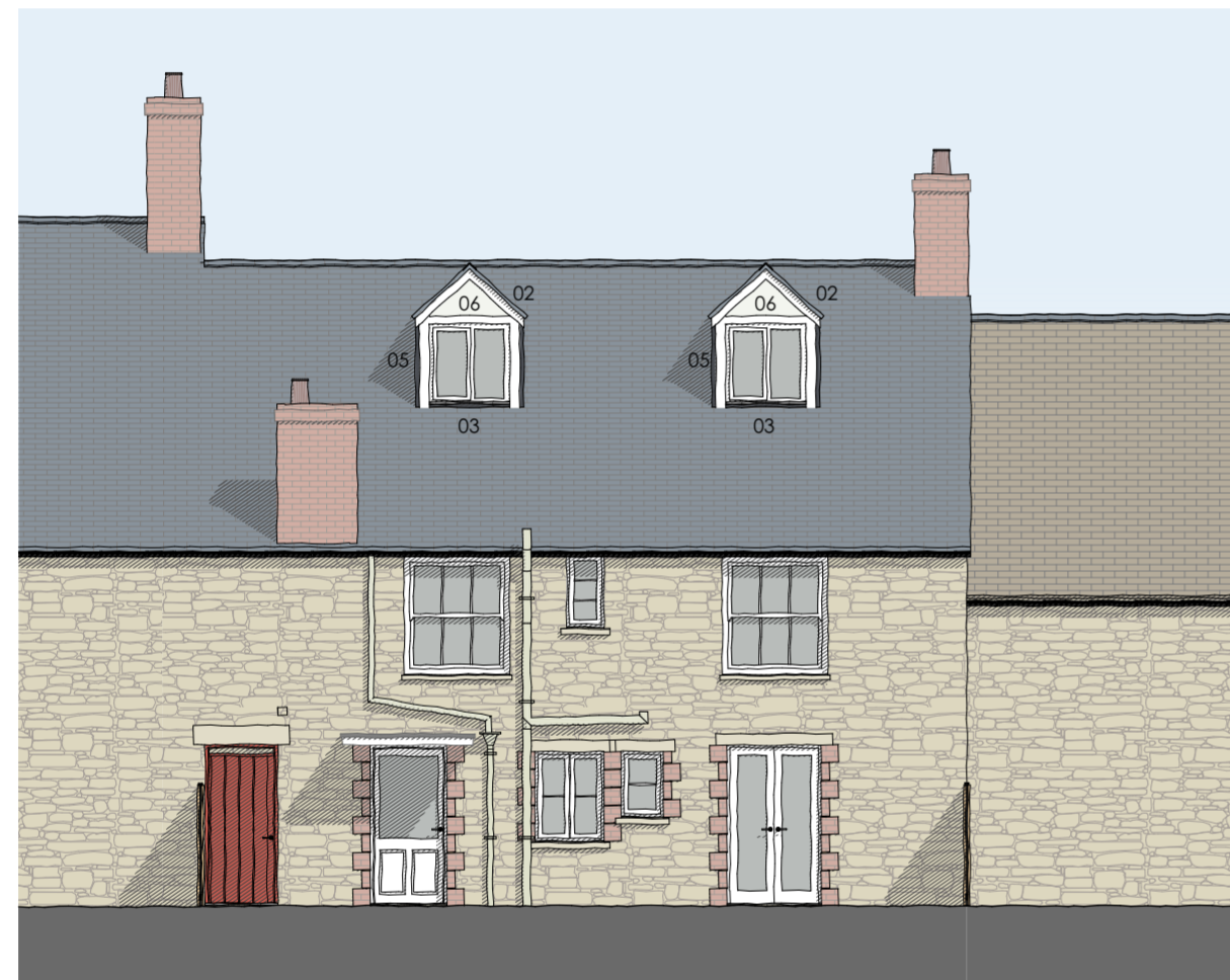
E-03 Elevation 1:100