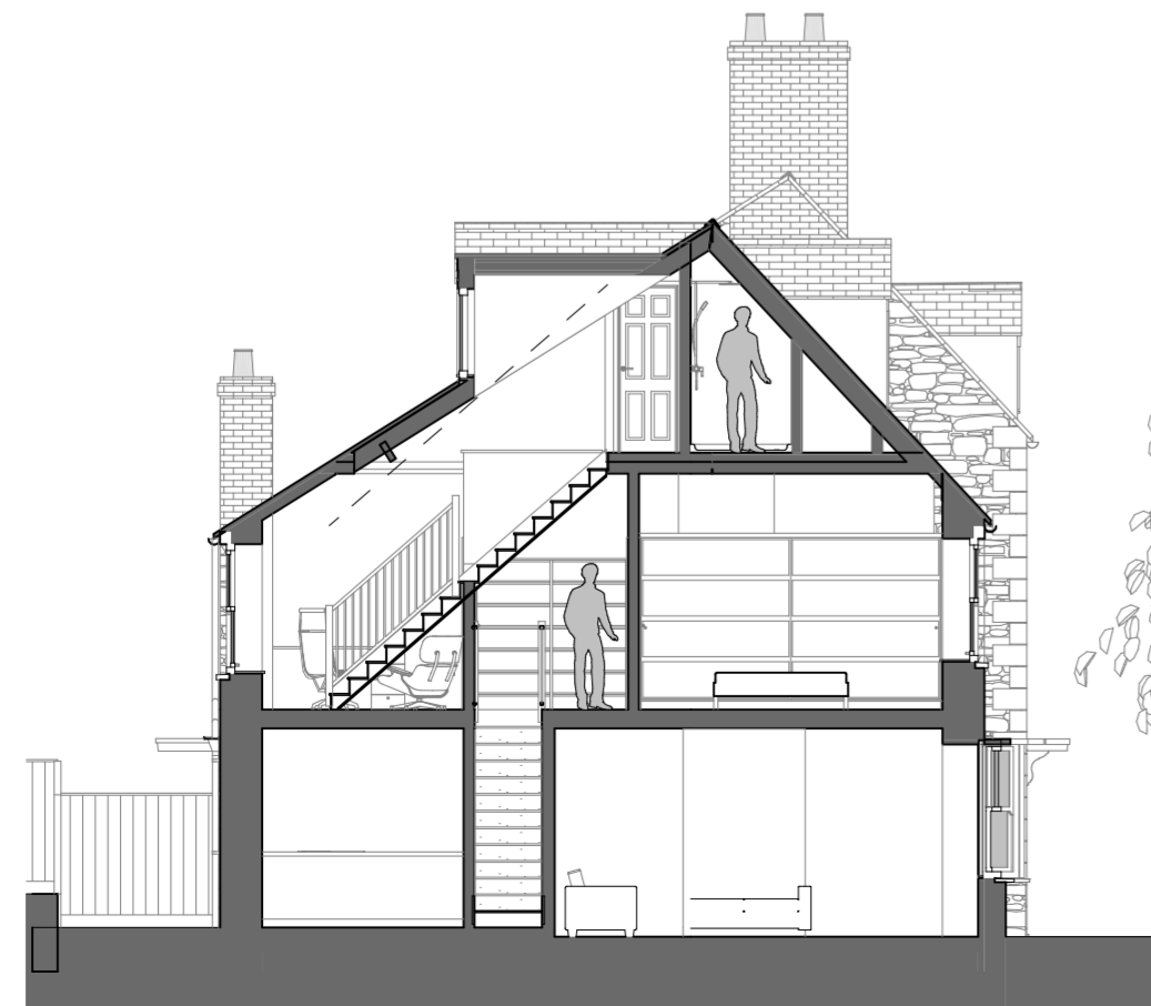
S-02 Building Section 1:100