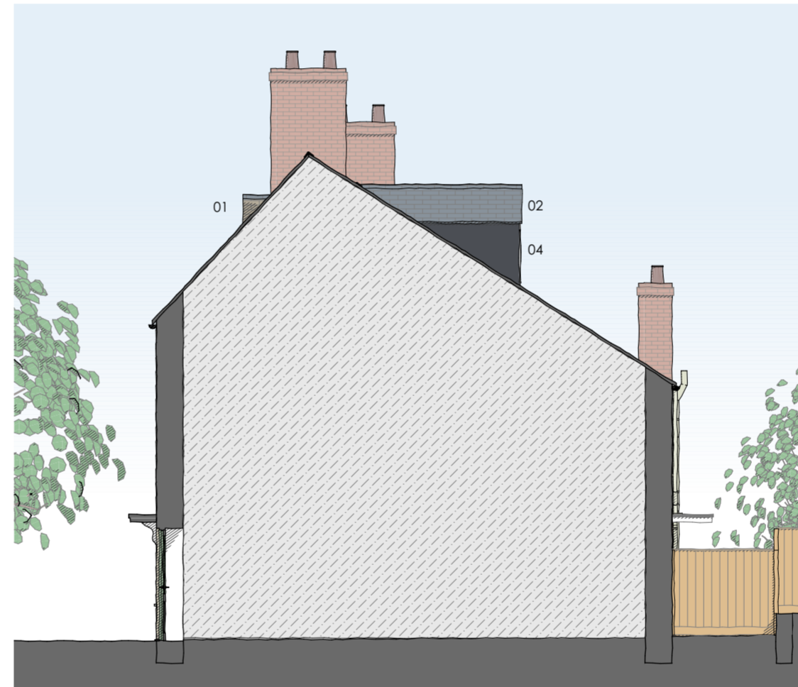
E-04 Elevation 1:100