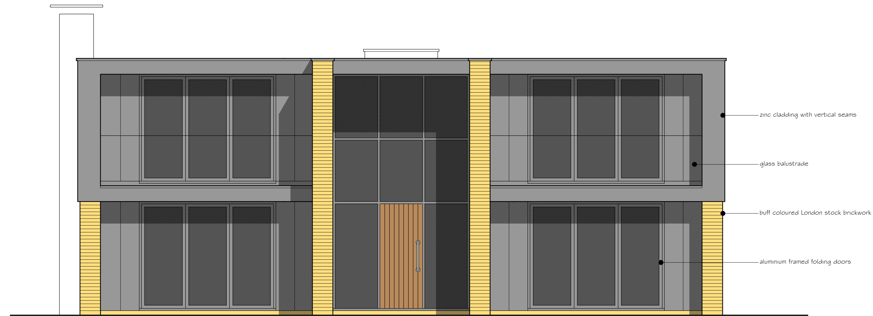
PROPOSED FRONT ELEVATION SCALE 1:50 @A1 0 1 2 3 4m