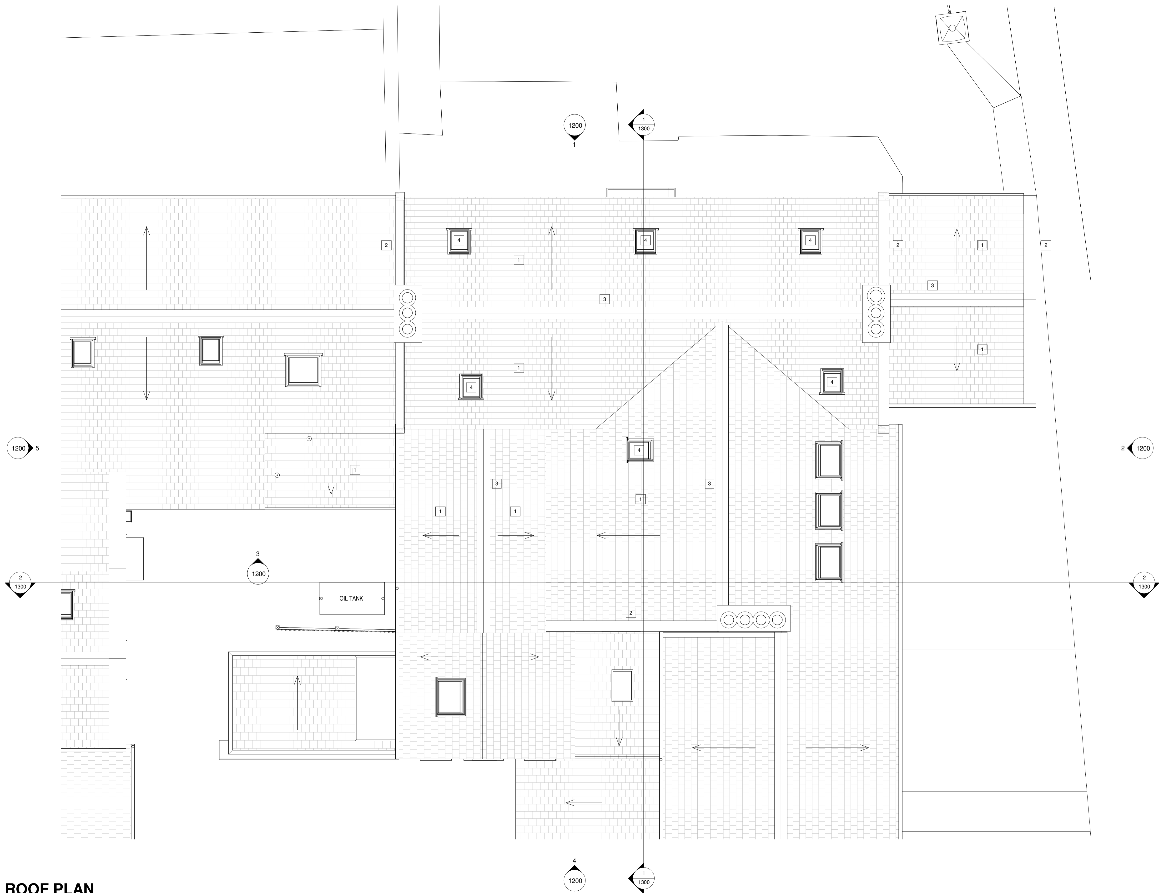
EXISTING ROOF PLAN 1 : 50