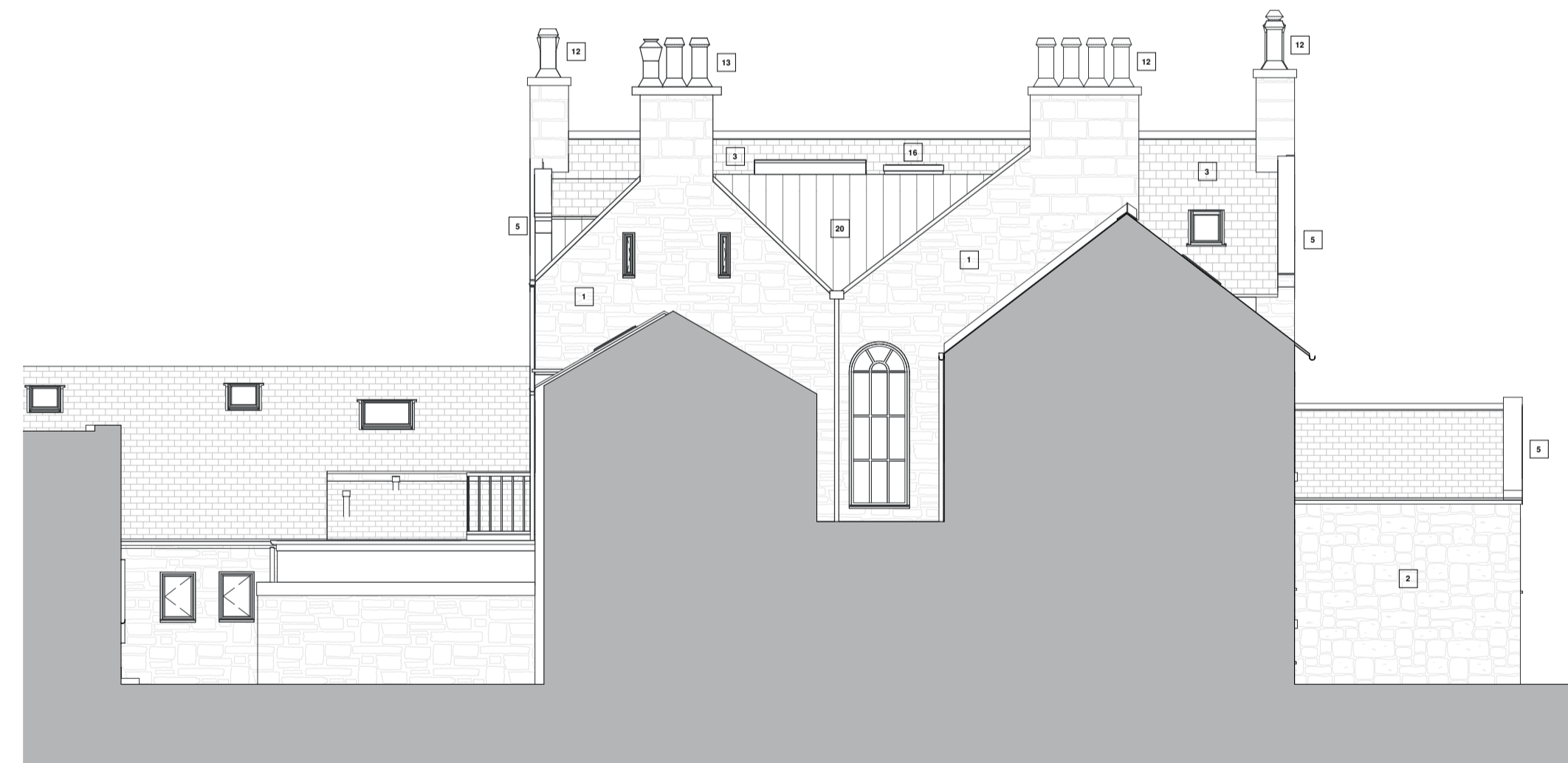
PROPOSED NORTH ELEVATION 2 1 : 100