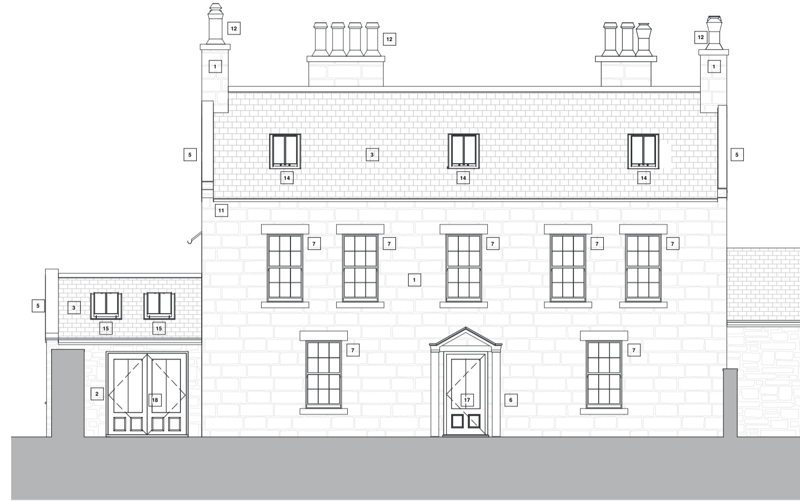
PROPOSED SOUTH ELEVATION 1 : 100