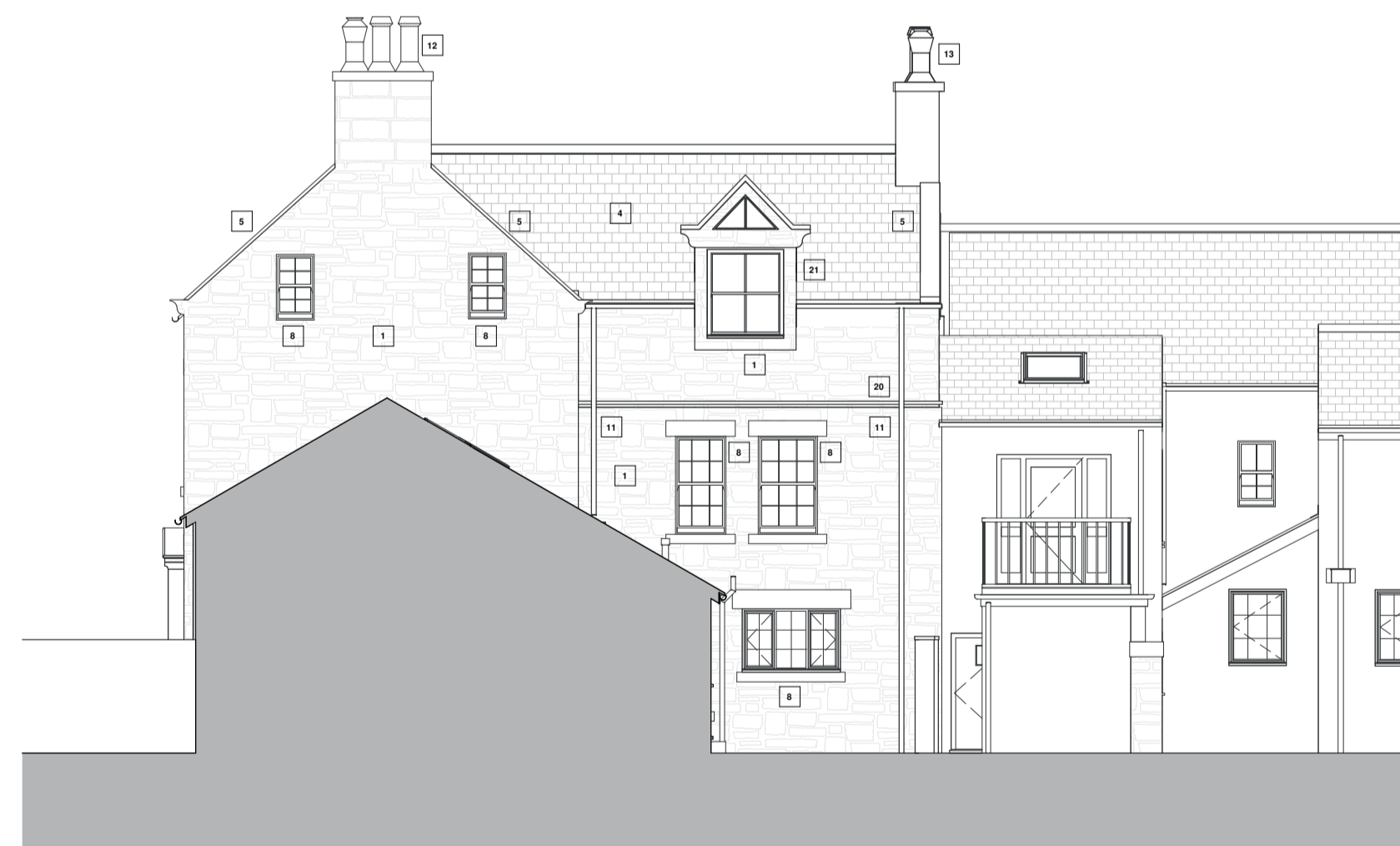
PROPOSED EAST ELEVATION 1 : 100