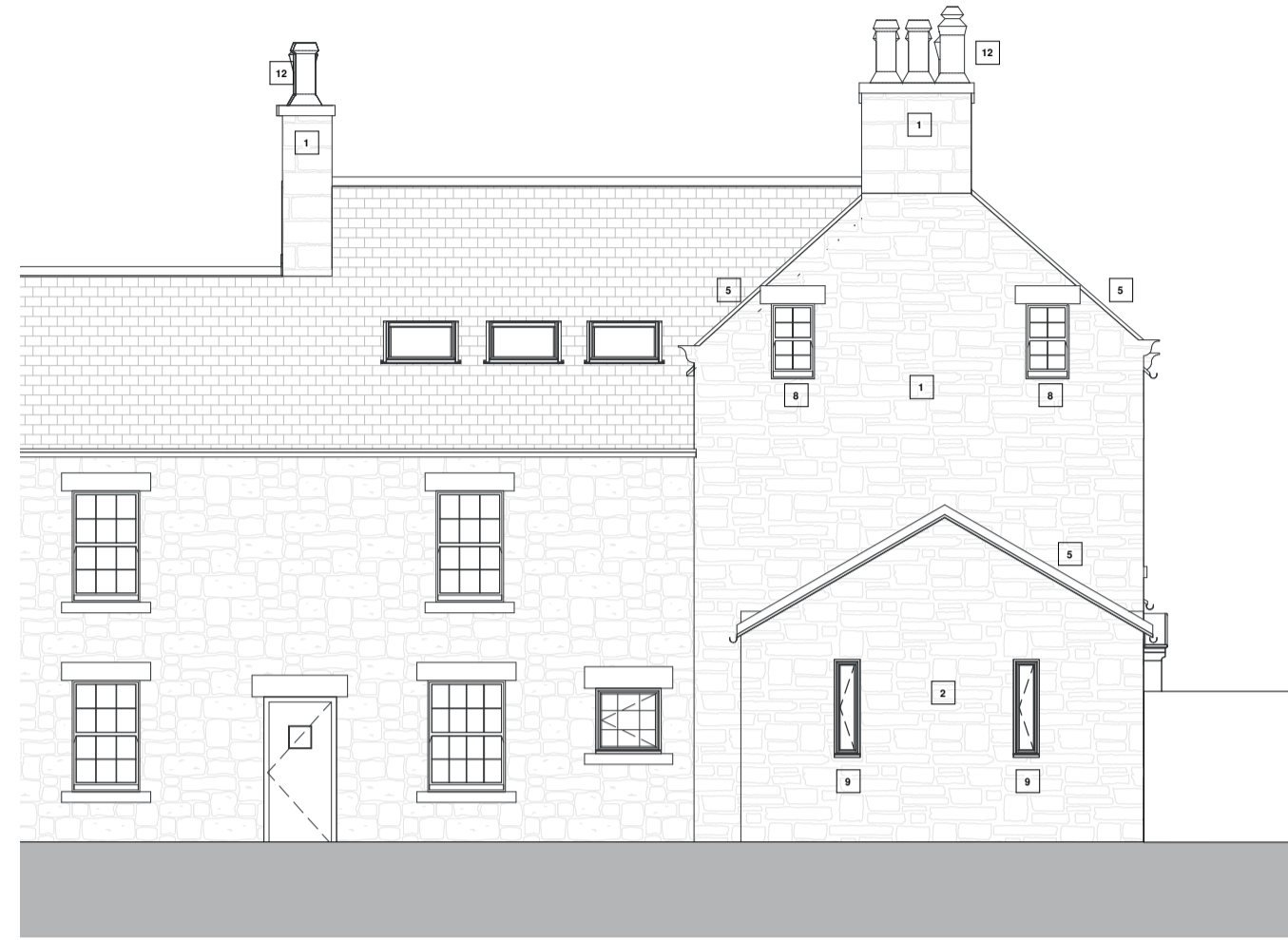
PROPOSED WEST ELEVATION 1 : 100