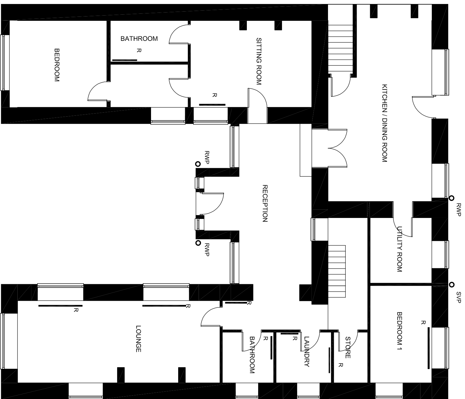
Existing Ground Floor Plan