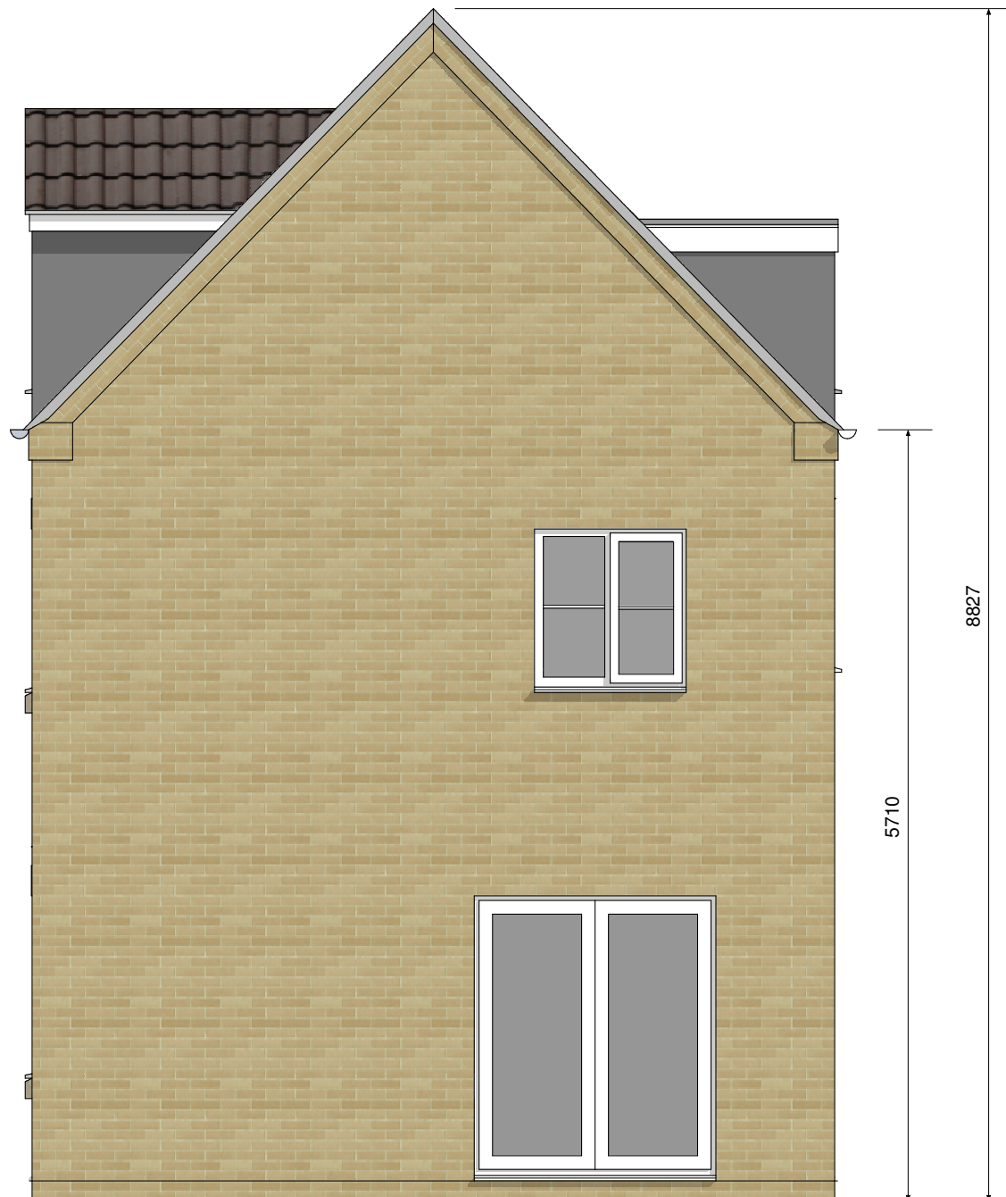
Existing West Elevation