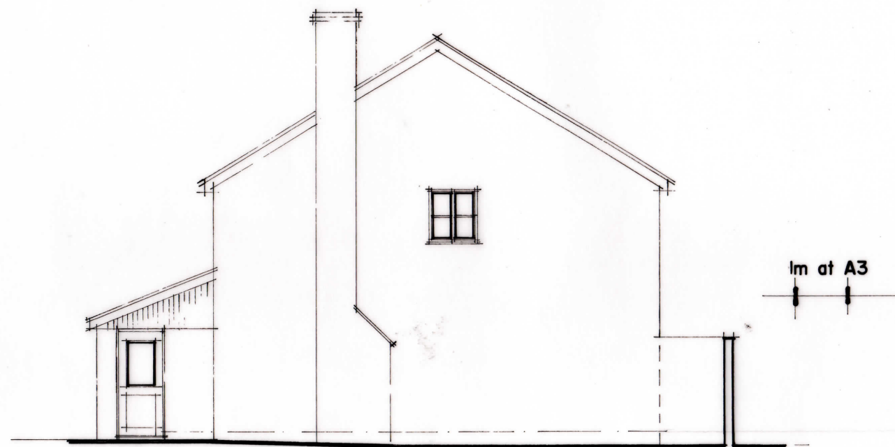
SIDE south west