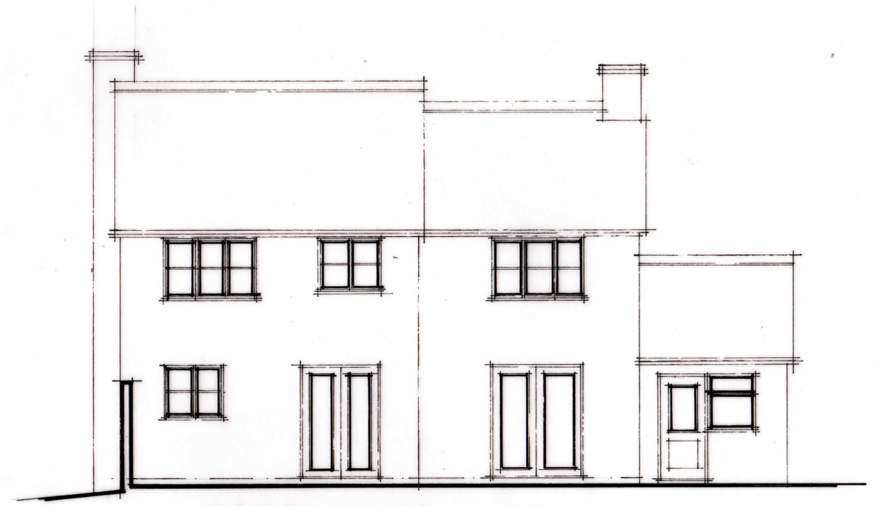
REAR south east