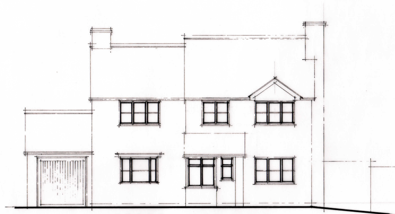
FRONT north west