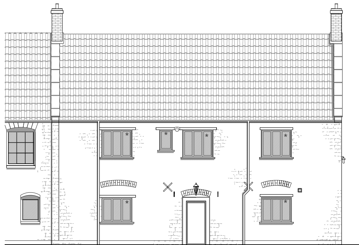
Proposed East Elevation (Rear)

The existing North and West elevations will remain unchanged as part of the proposals for this application