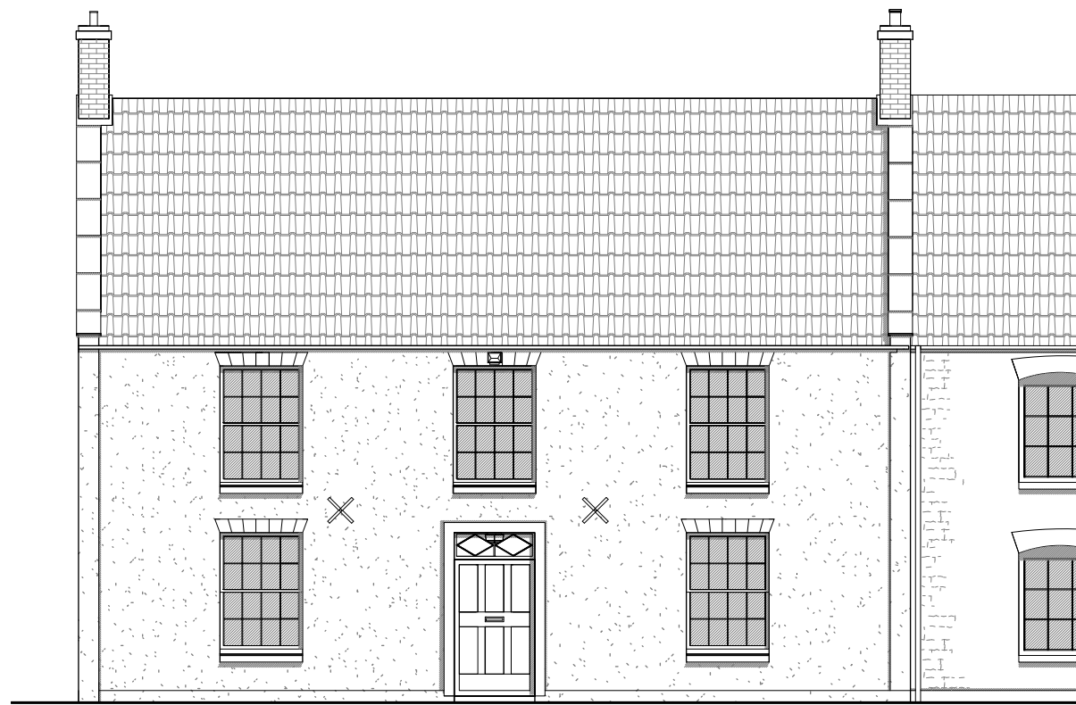
Existing West Elevation (Front)