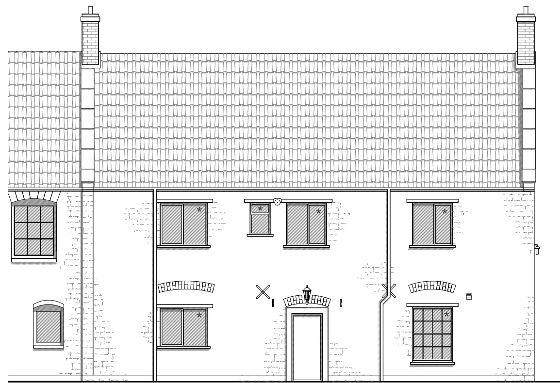
Existing East Elevation (Rear)