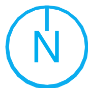
Block Plan as Existing