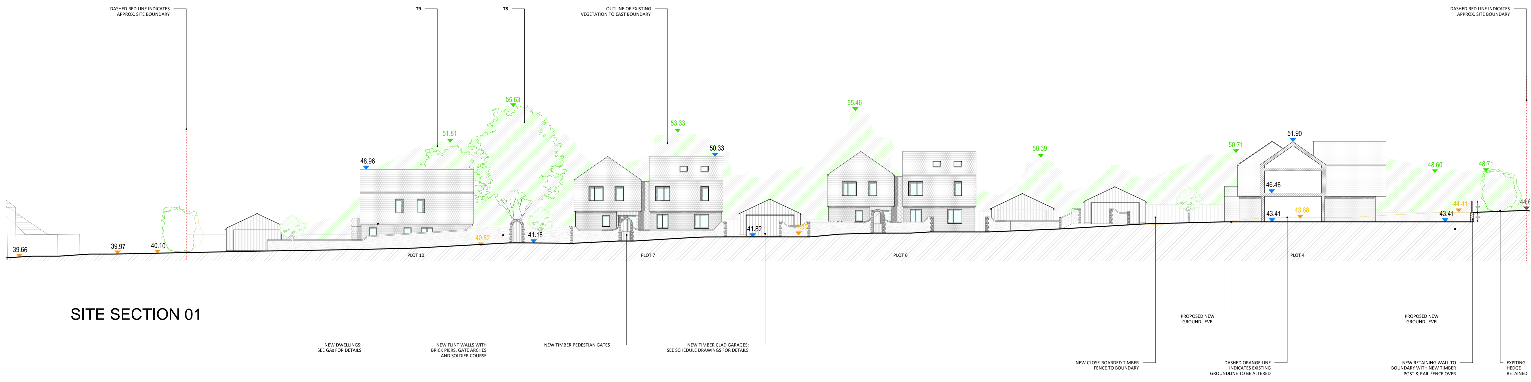
SITE SECTION 01