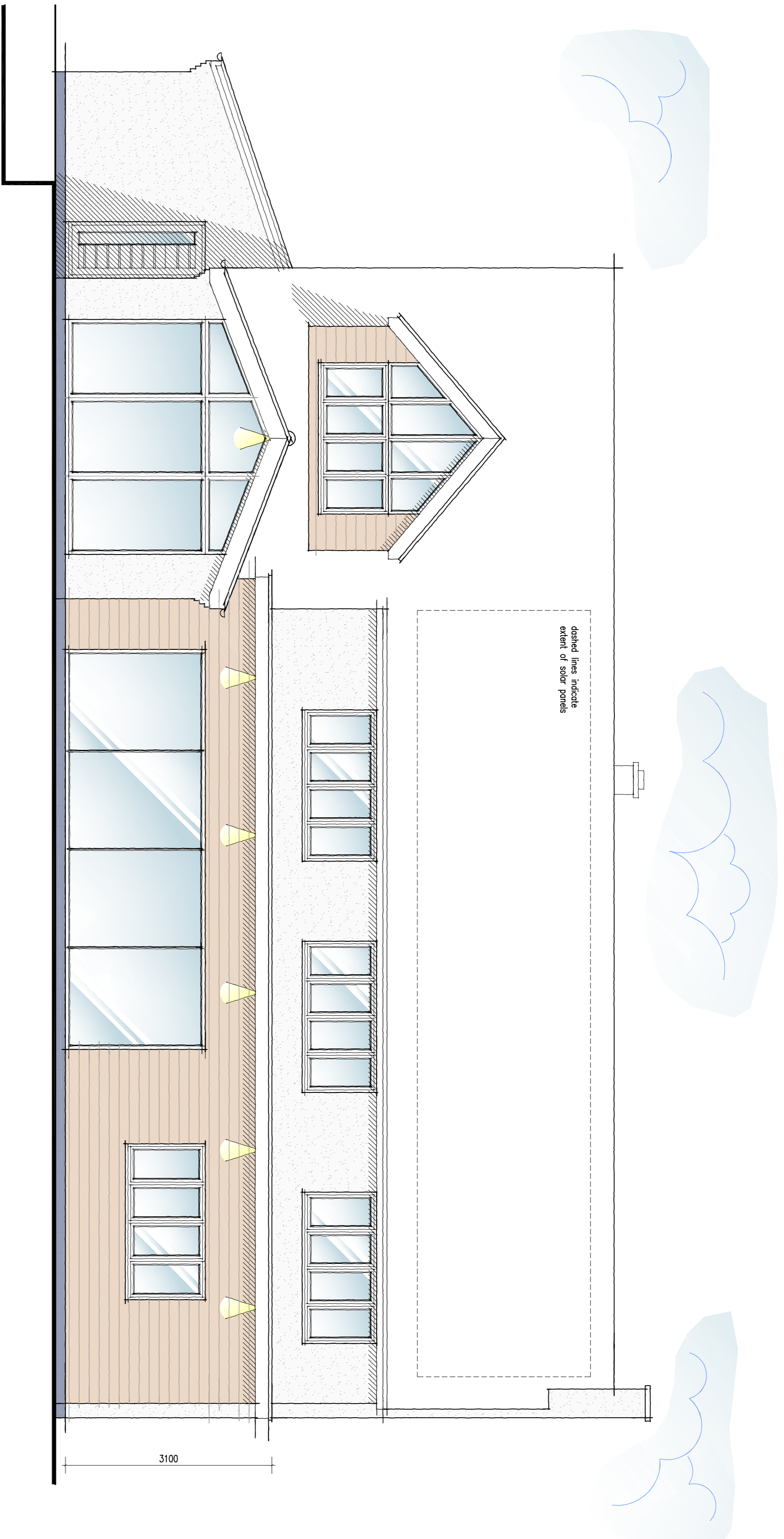
Proposed Rear Elevation Scale 1:50