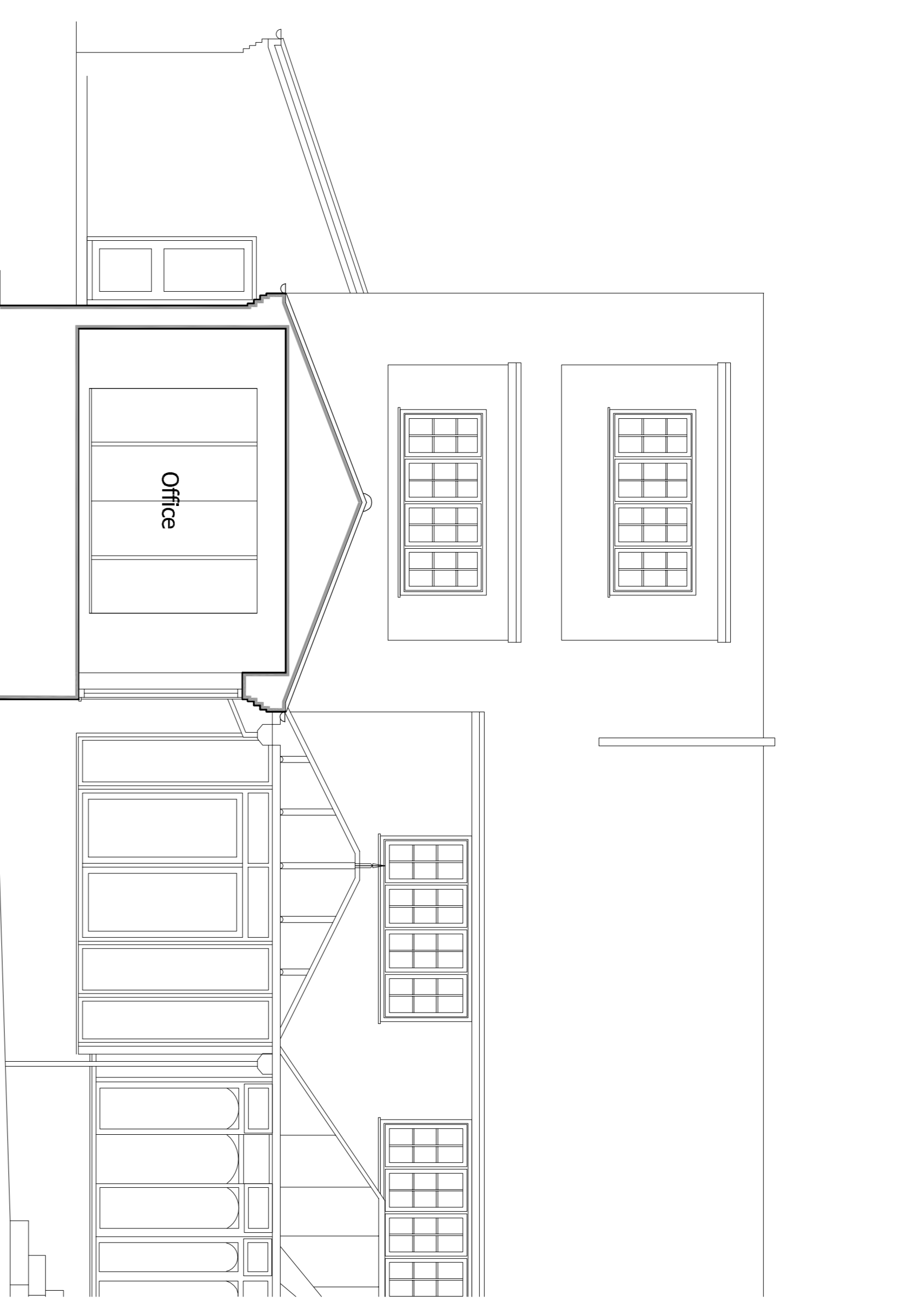
Existing Section A-A Scale 1:200