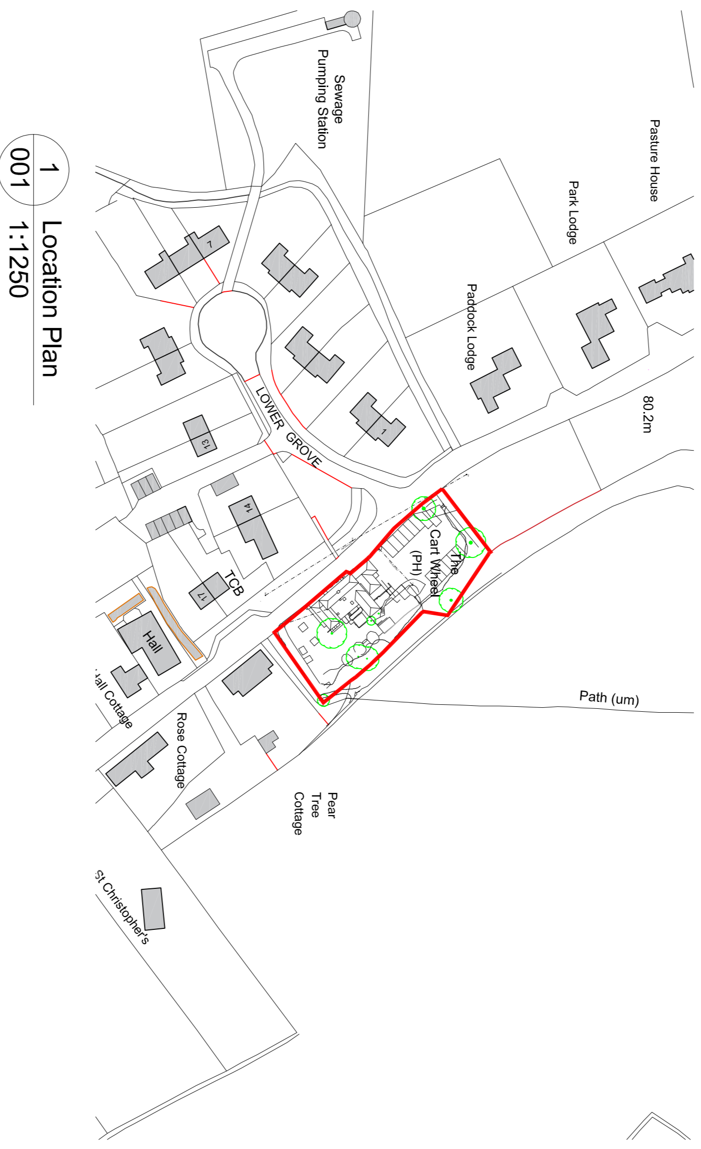
1 Location Plan 001 1:1250