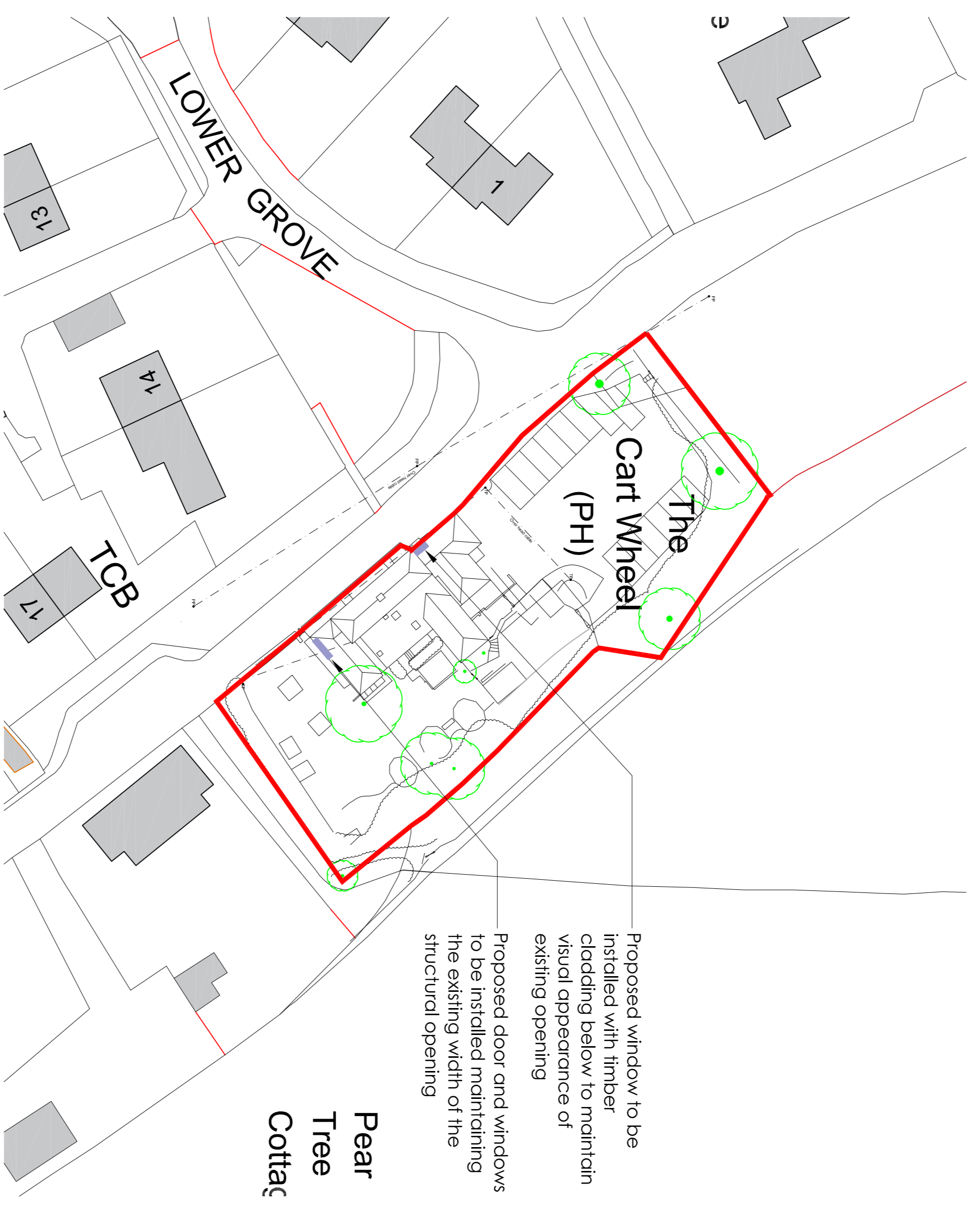
2 Site Plan 001 1:500