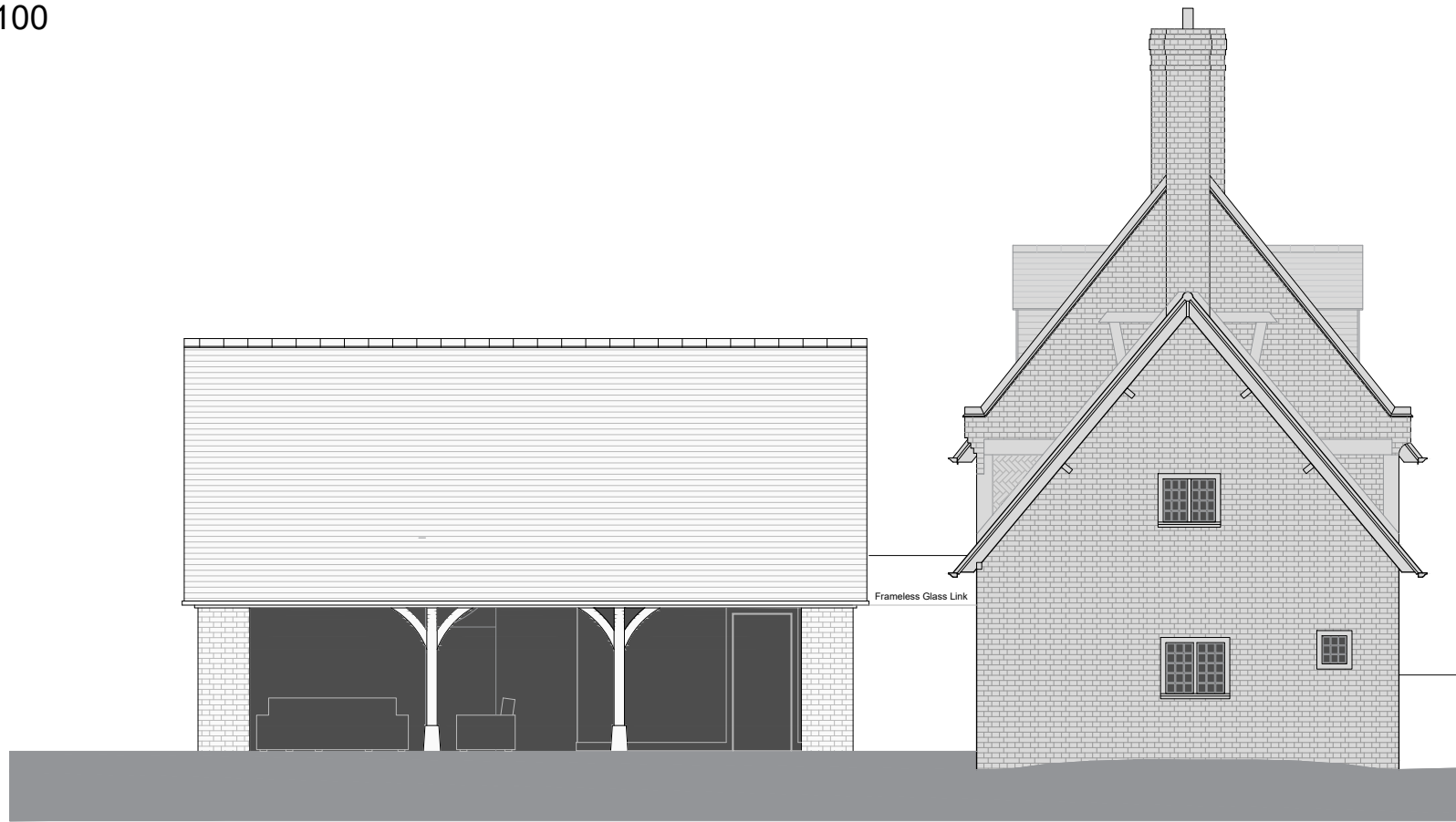
PROPOSED NORTH EAST FACING ELEVATION Scale 1:100