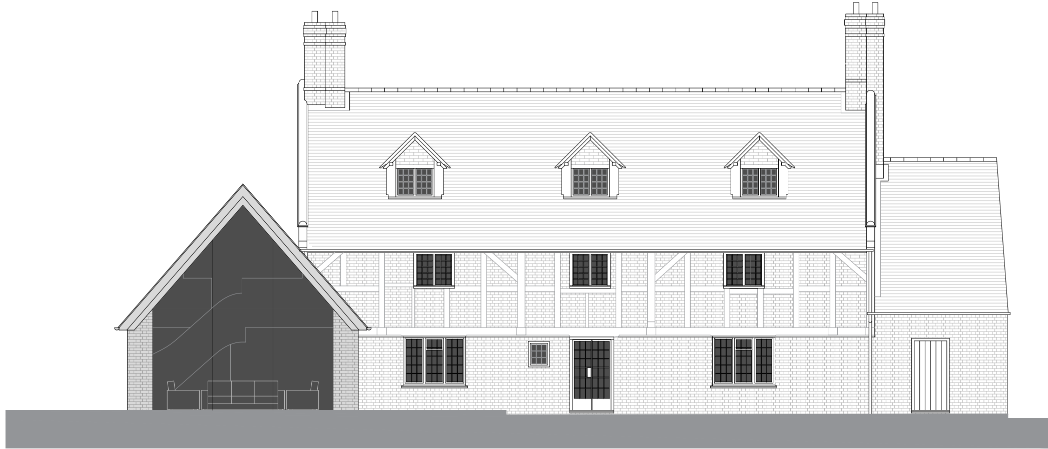
PROPOSED SOUTH EAST FACING ELEVATION Scale 1:100