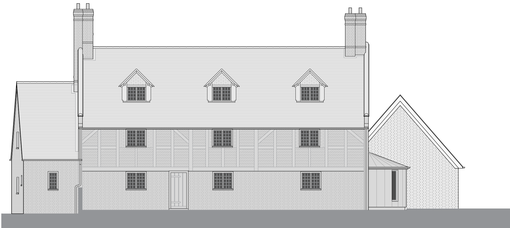
PROPOSED NORTH-WEST FACING ELEVATION Scale 1:100