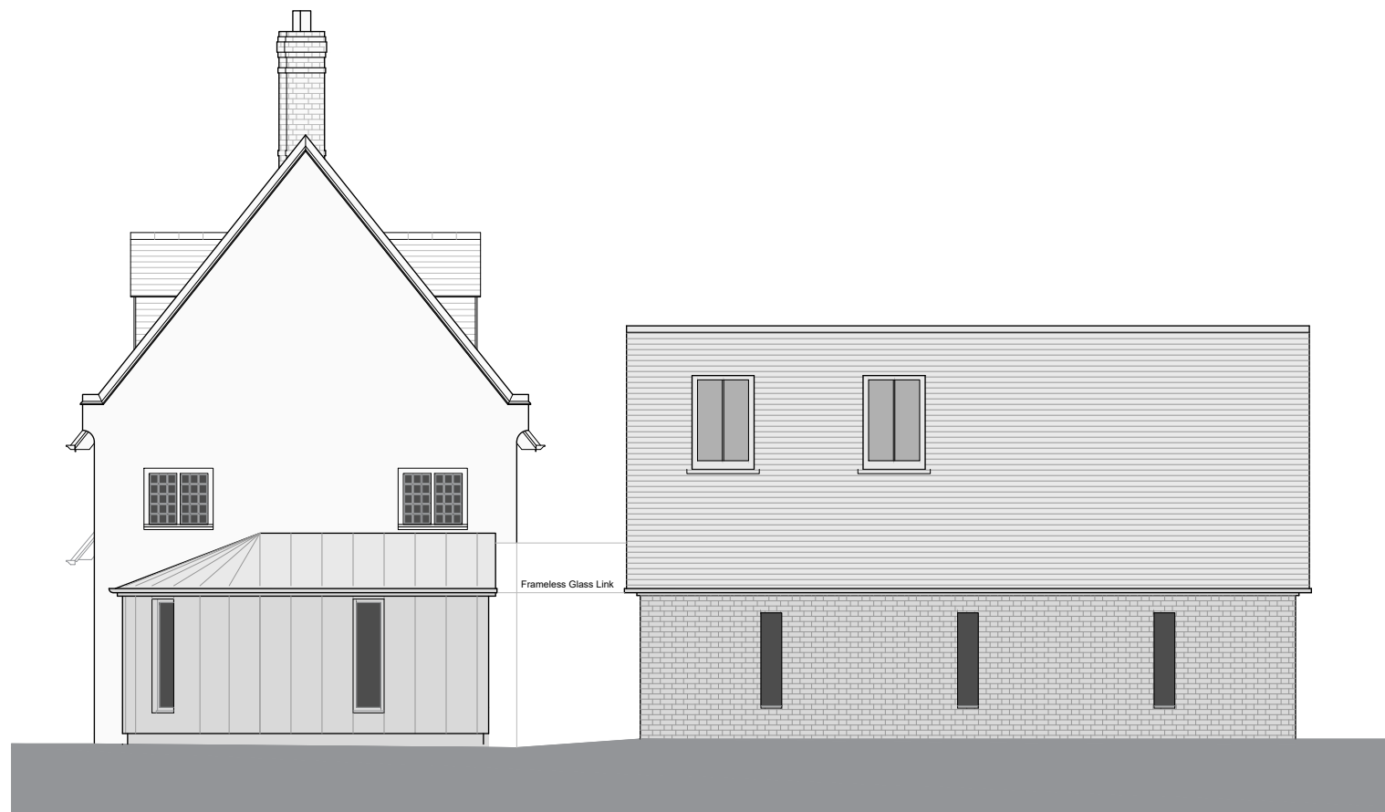
PROPOSED SOUTH-WEST FACING ELEVATION Scale 1:100