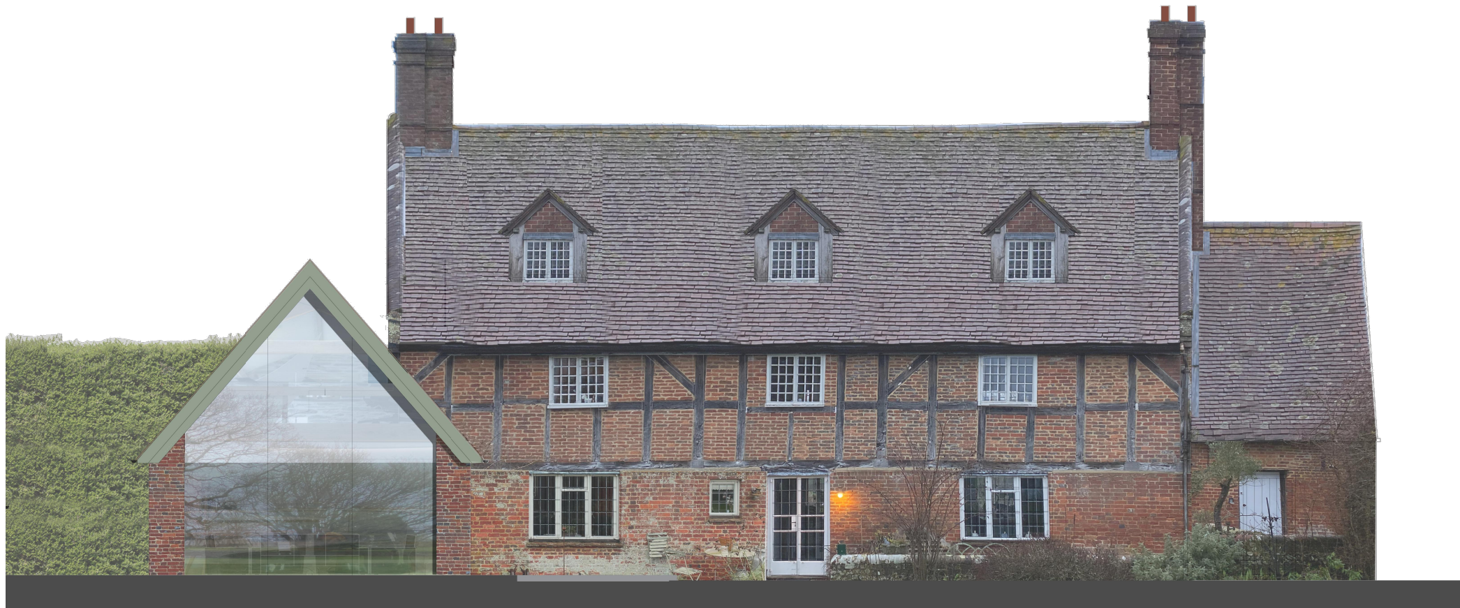
PROPOSED SOUTH EAST FACING ELEVATION Scale 1:100