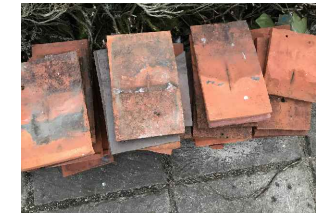
Roof tiles as per granted on 10th March 2021 application no. 22/10010