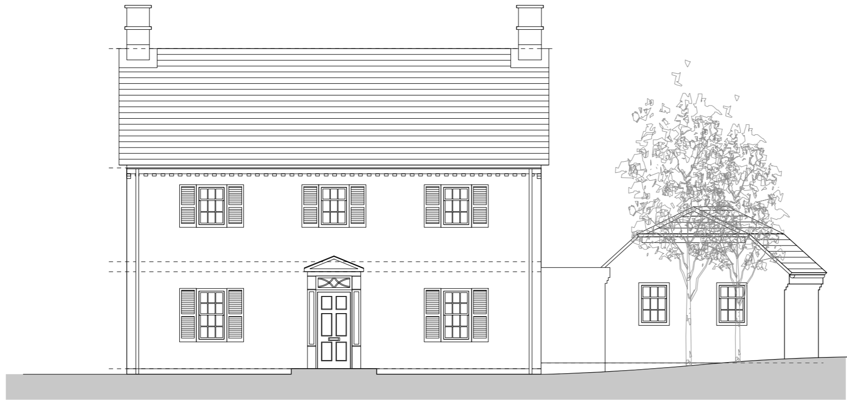
1 EXISTING NORTH ELEVATION Scale: 1:100