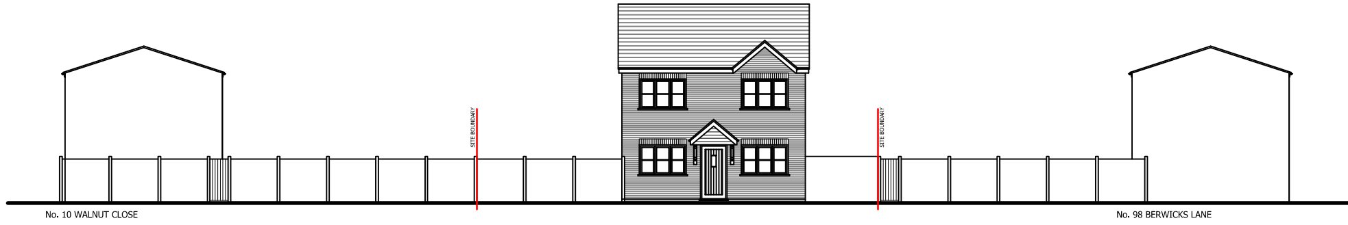
STREET SCENE @1:200