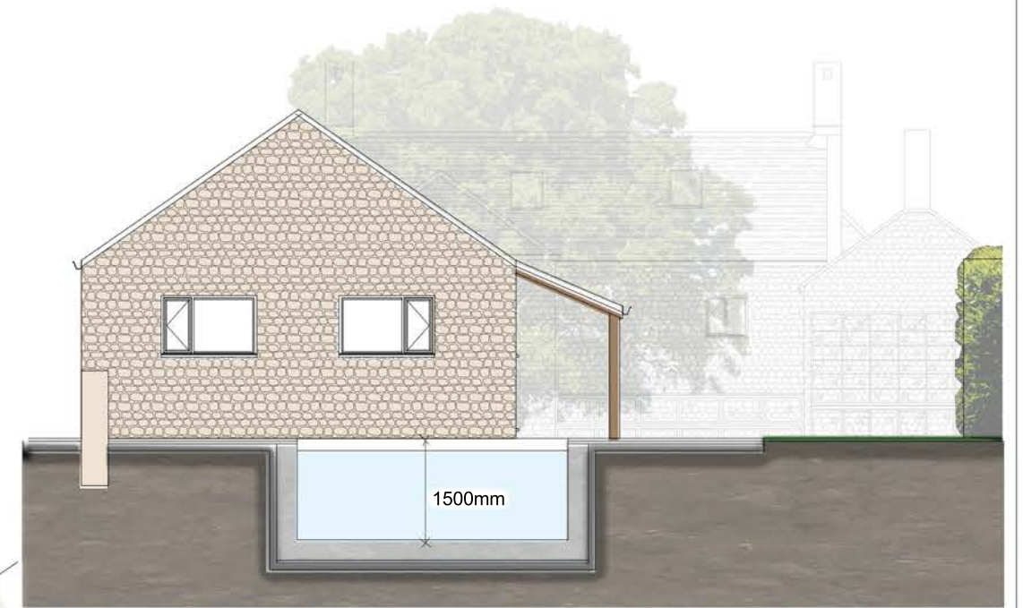
Swimming Pool Section 1:100