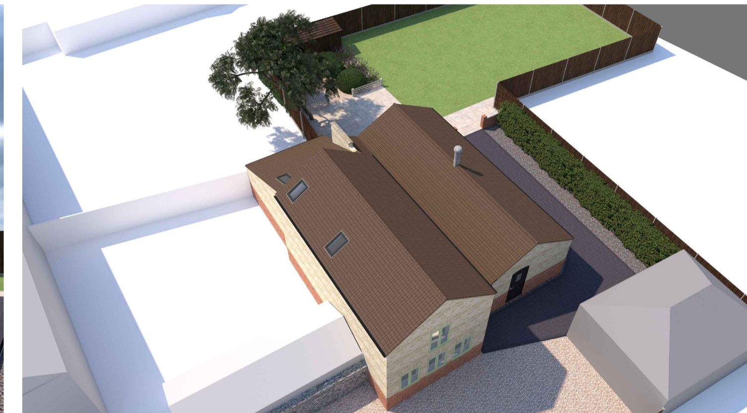
Existing Visuals (n.t.s)