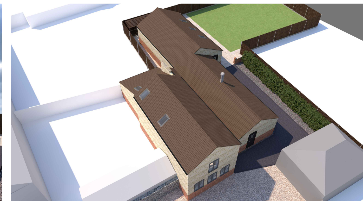
Proposed Visuals (n.t.s)

this drawing has been produced for planning permission purposes only