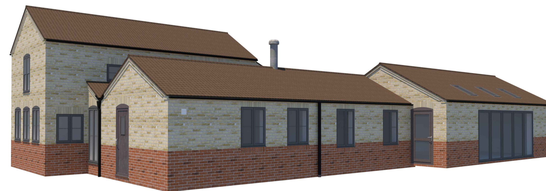
Proposed Visual (n.t.s)

this drawing has been produced for planning permission purposes only