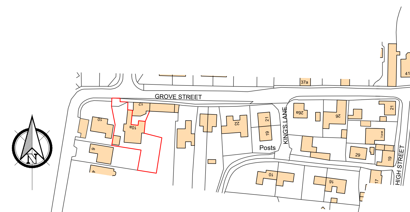
Site Location Plan (scale 1:1250)

this drawing has been produced for planning permission purposes only