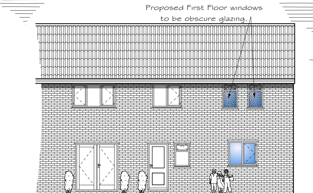
Rear Elevation as Proposed.

Proposed First Floor windows to be obscure glazing.