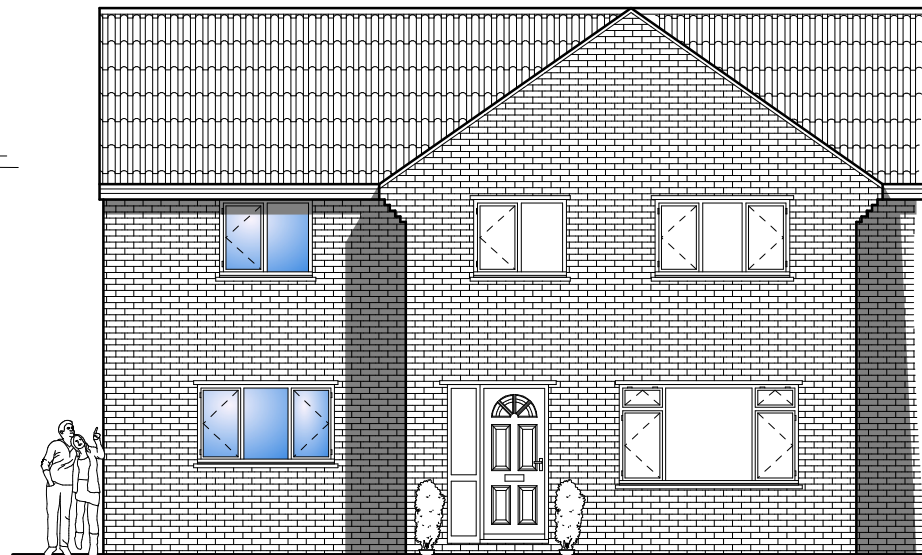
Front Elevation as Proposed.

DRAWING PREPARED BY: MARK GARFITT, ARCHITECTURAL TECHNOLOGIST. Tel: 07789 996636 Email: mark@mgarchitecturaldesigns.co.uk