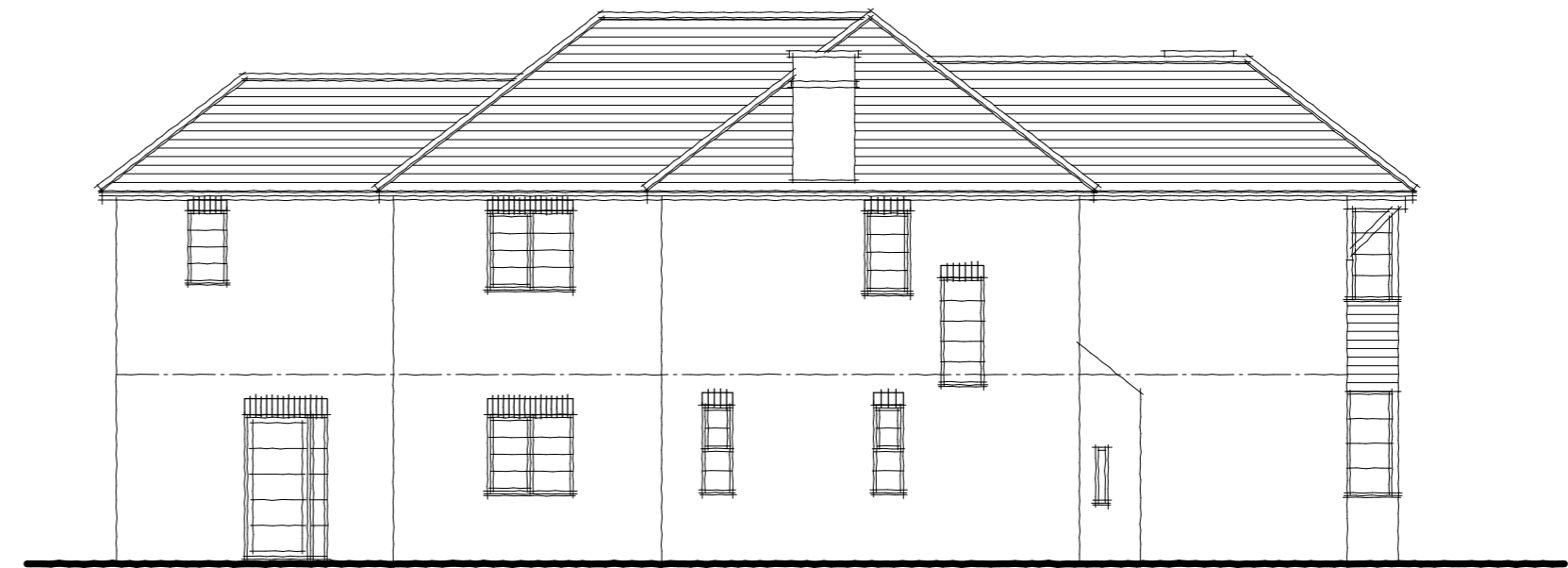
Side Elevation (South)