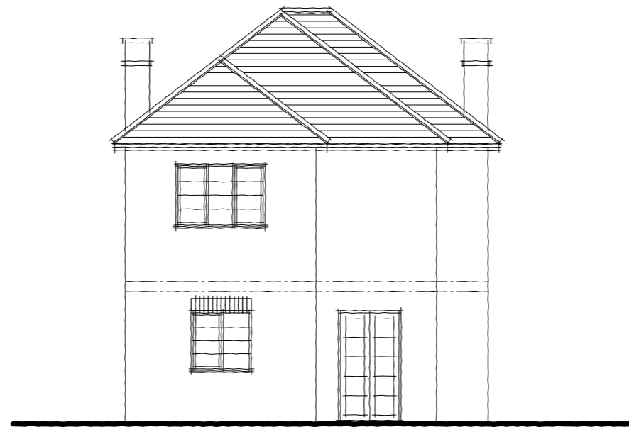
Rear Elevation (West)