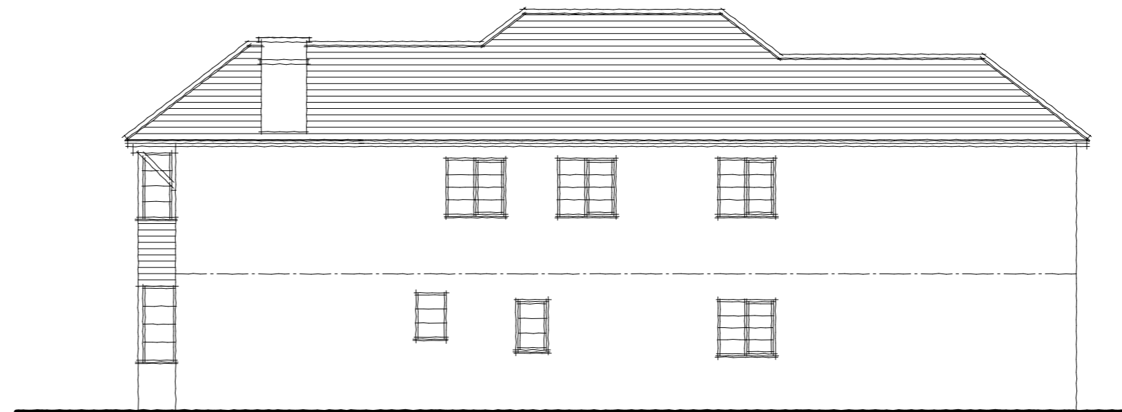
Side Elevation (North)