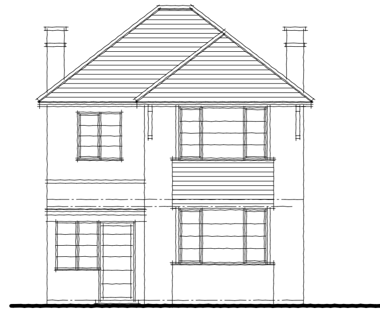
Front Elevation (East)

NOTE: This Drawing Has Been Produced To Obtain Planning/Building Regulations Approval Only. All Dimensions, Levels And Roof Pitch To Be Checked On Site. If In Doubt Ask. Use Only Noted Dimensions- Do Not Scale. If This Drawing Has Been Received Electronically It Is The Recipients Responsibility To Print The Document To The Correct Scale.