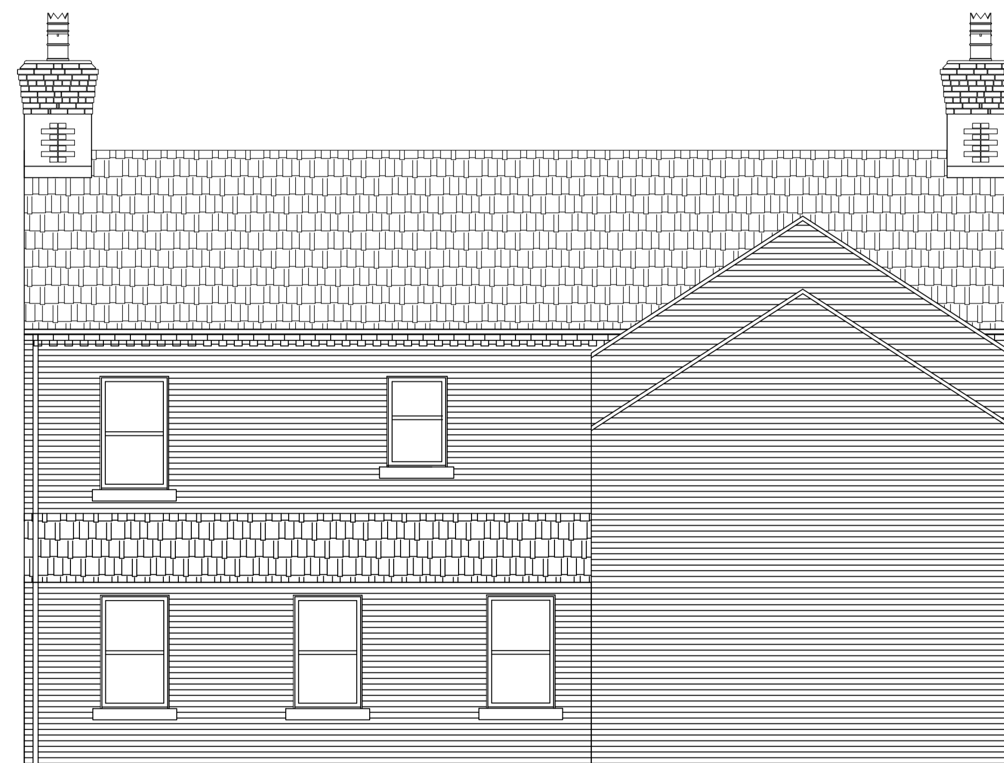
REAR ELEVATION 1:50