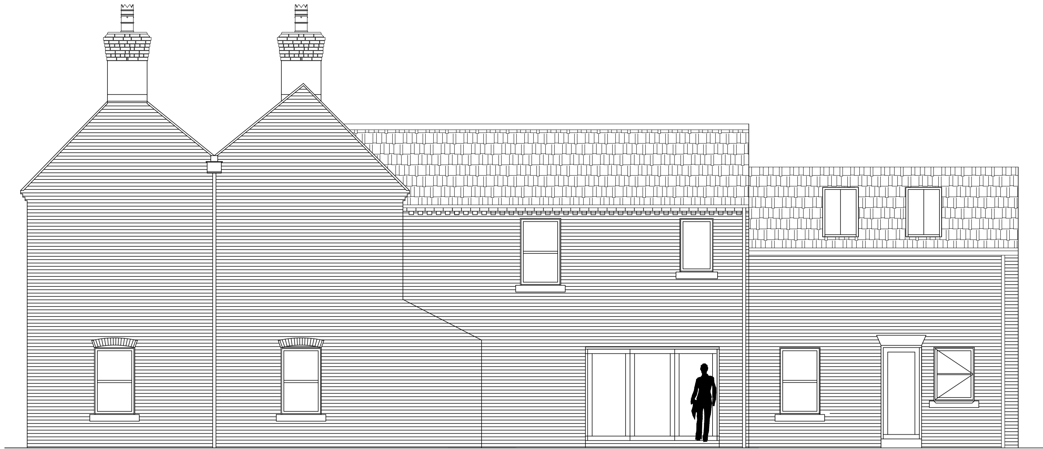
SIDE ELEVATION 1:50