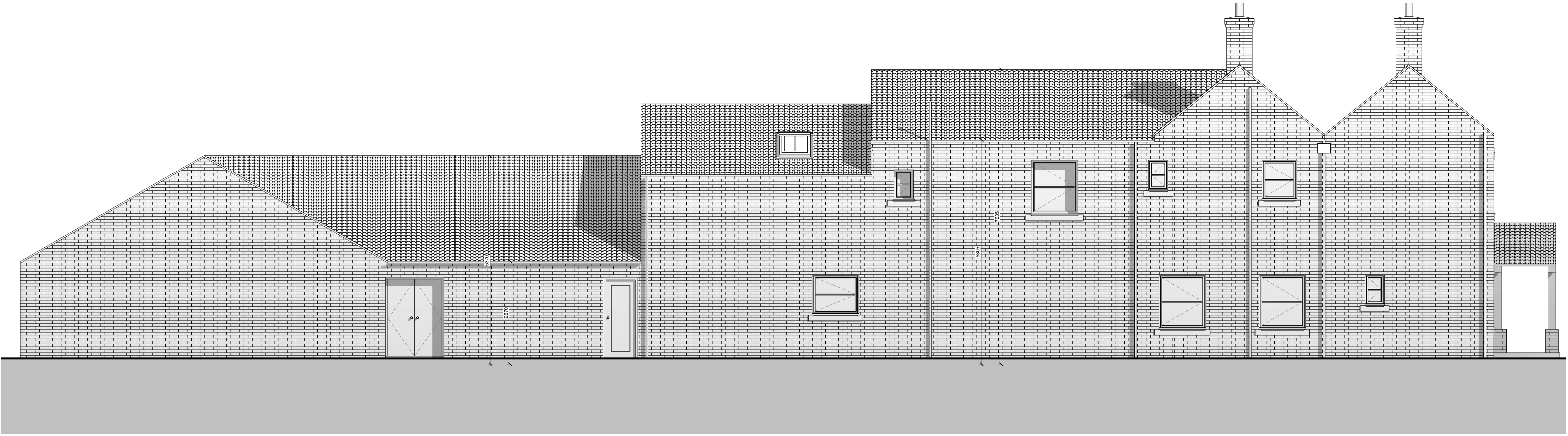
North Elevation Field Facing 1 : 50

GENERAL NOTES 1. Any discrepancies found between this drawing and other documents should be referred to immediately. 2. This drawing should be removed from currency immediately after a revised version is issued. 3. All dimensions in millimetres. This drawing and its subject matter are the confidential property of Max Design and shall not be copied, reproduced, used or disclosed to others without their prior written authority.