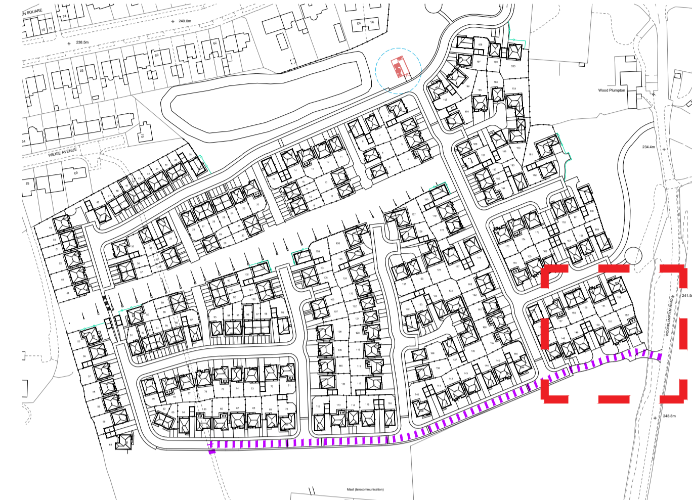
Site Key @1:2500