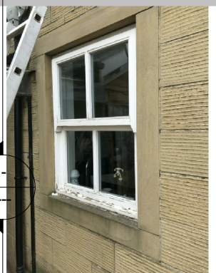
Photos of existing windows