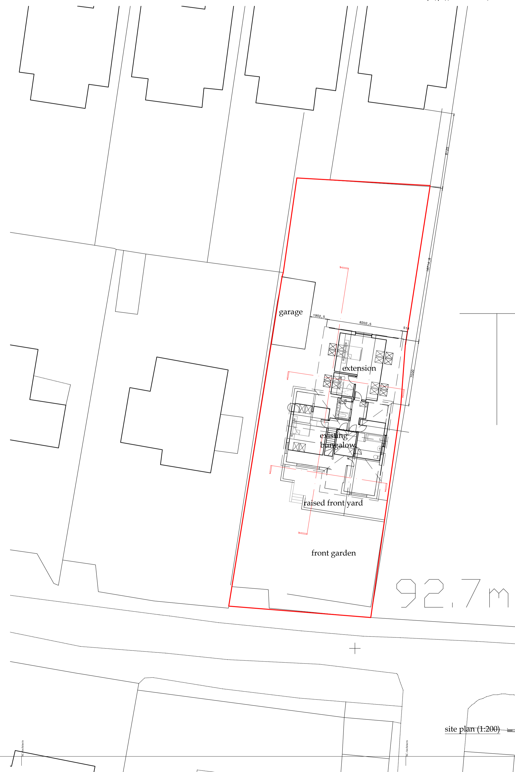
site plan (1:200)