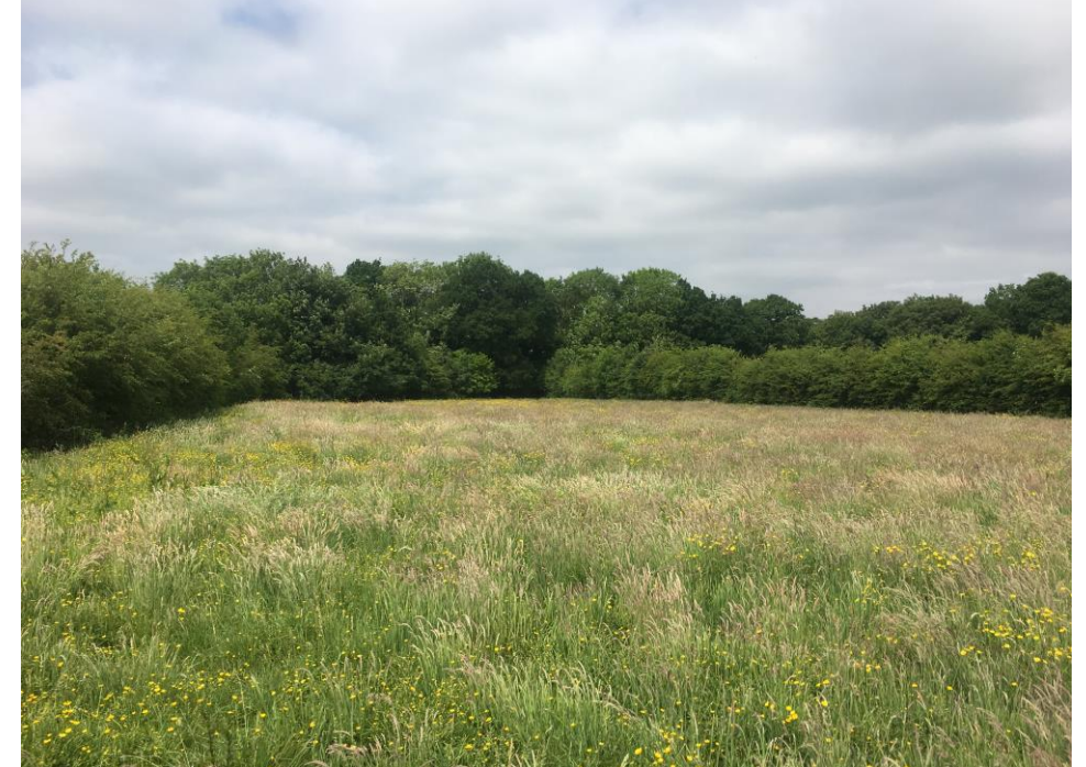
No 24 Northern portion of the site, separated by two hedgerows, looking west.