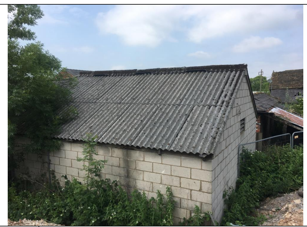
No 2 Looking south west towards the previous farming buildings, showing vegetation outbreak and potential asbestos cement roofing.

No 1 Looking north from the site access road towards Wilmslow Old Road.