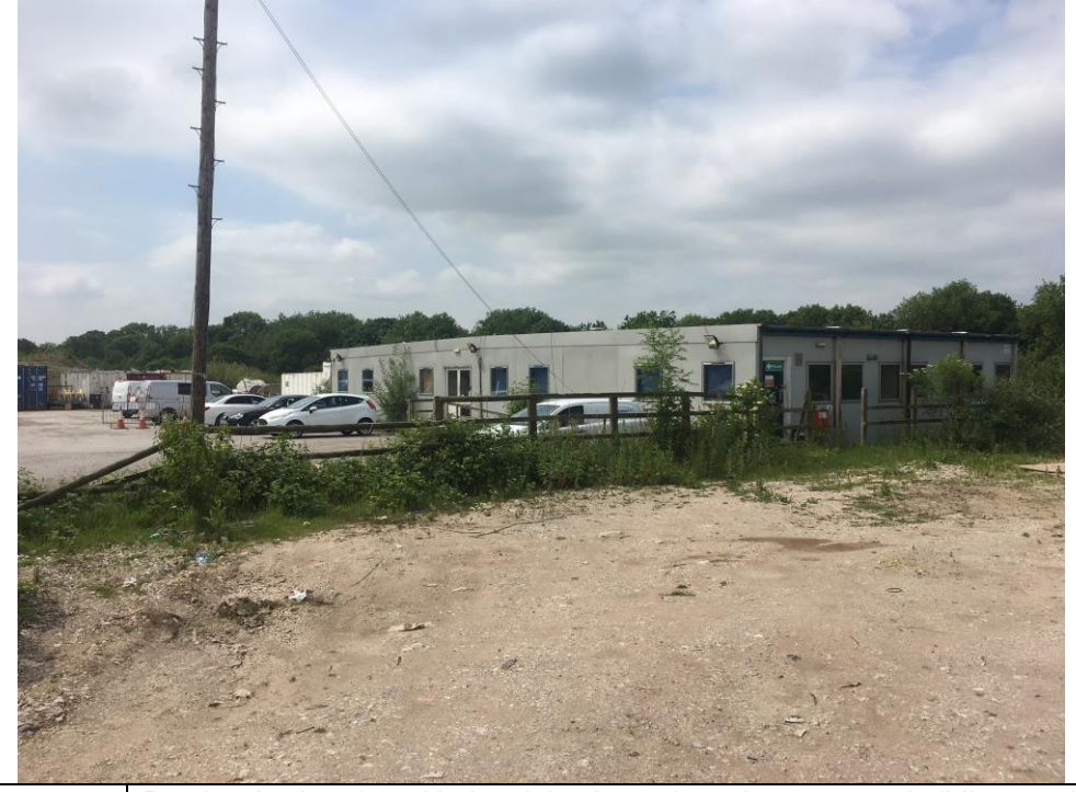
No 26 Previously abandoned industrial units and semi-permanent buildings to the west of the listed farm building, looking south west. Overhead powerlines present.