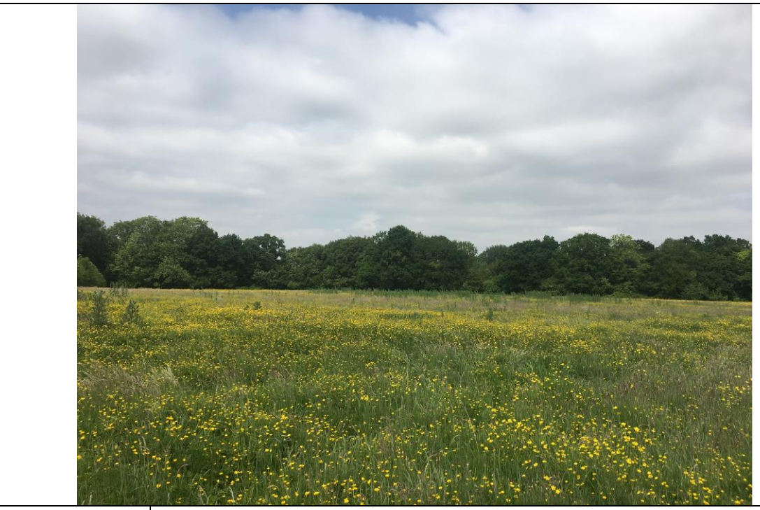
No 25 Northern most portion of the site, looking north west towards the Cotteril Clough Brook boundary.