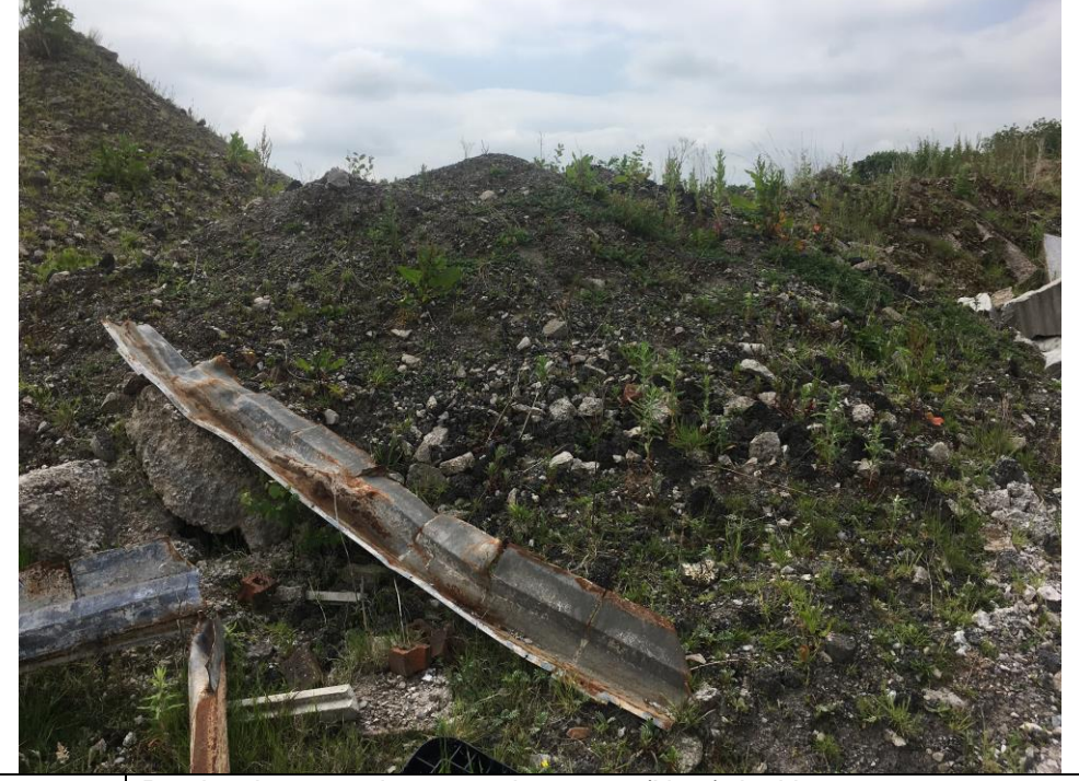
No 10 Previously covered construction waste (No 8), looking east.