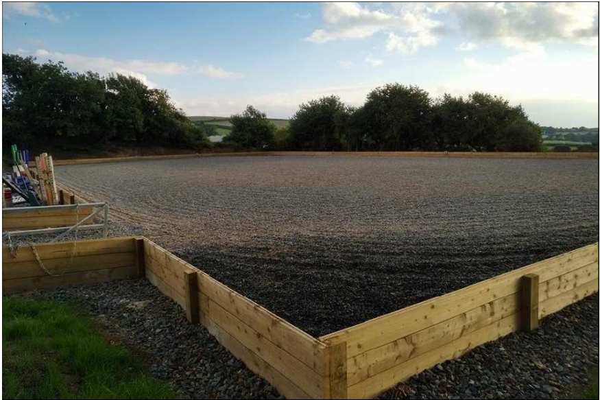
Example of sand school design with no post and rail NTS

Proposed drains which will connect into existing surface water drains for the existing tennis court