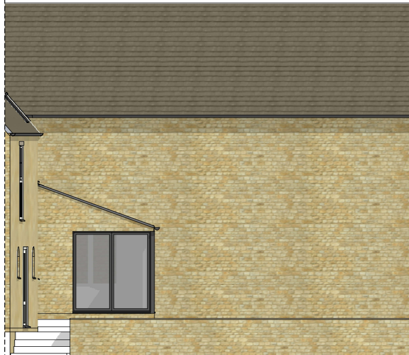
Proposed West Elevation