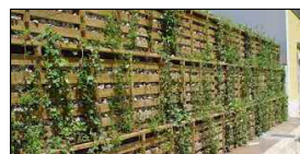
Example of a Permacrib retaining wall