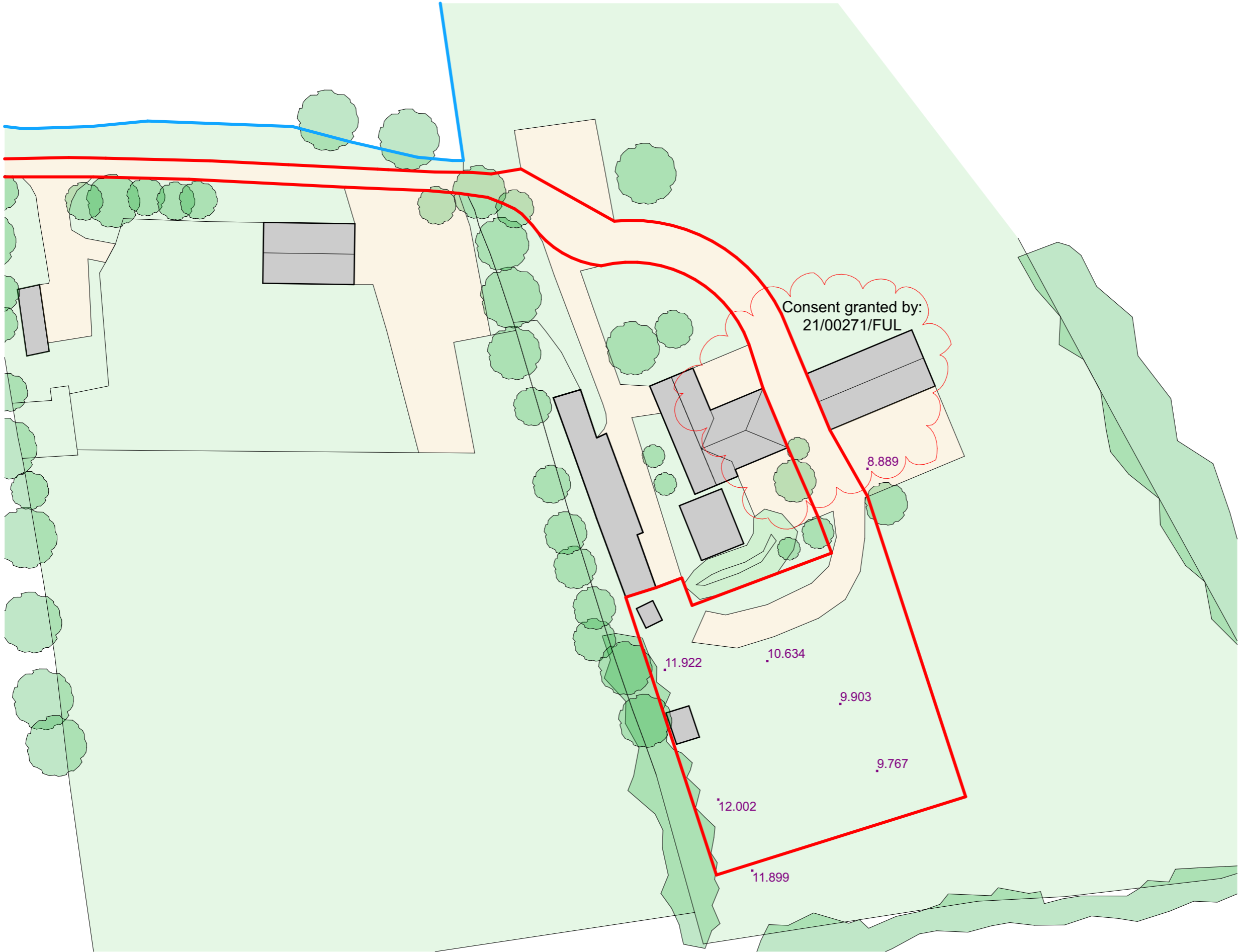
Existing Site Layout 1:500

— Linetype denotes ownership boundaries and current lease.