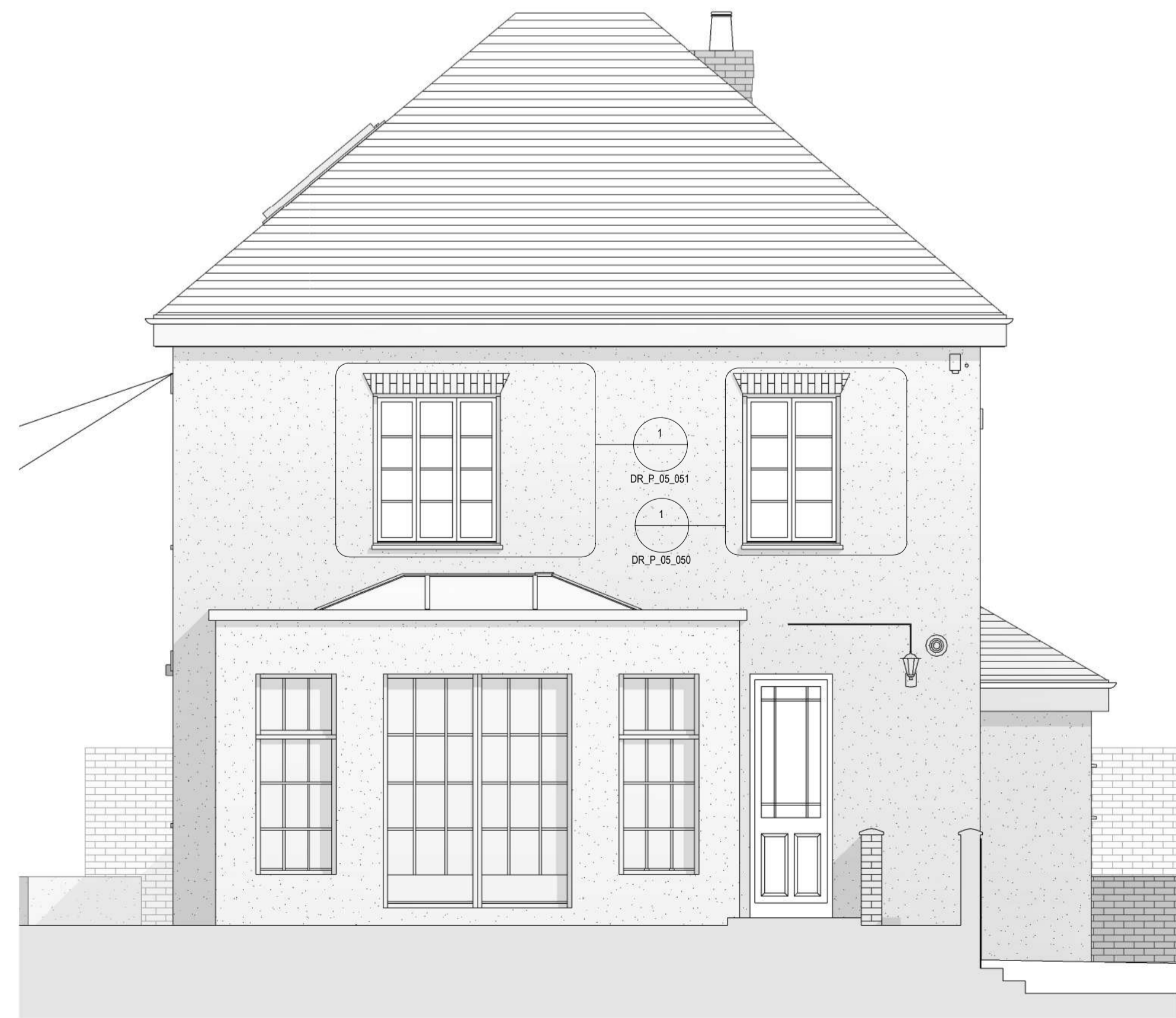
South West Elevation - Existing 1 : 50