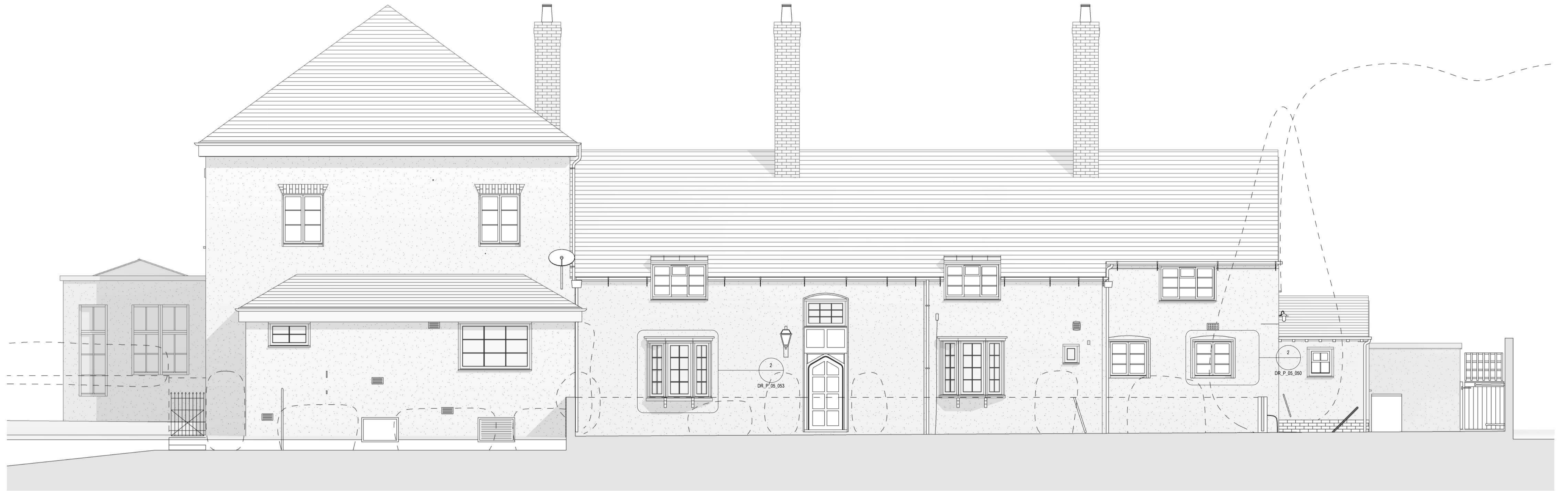
Southeast Elevation - Existing 1 : 50