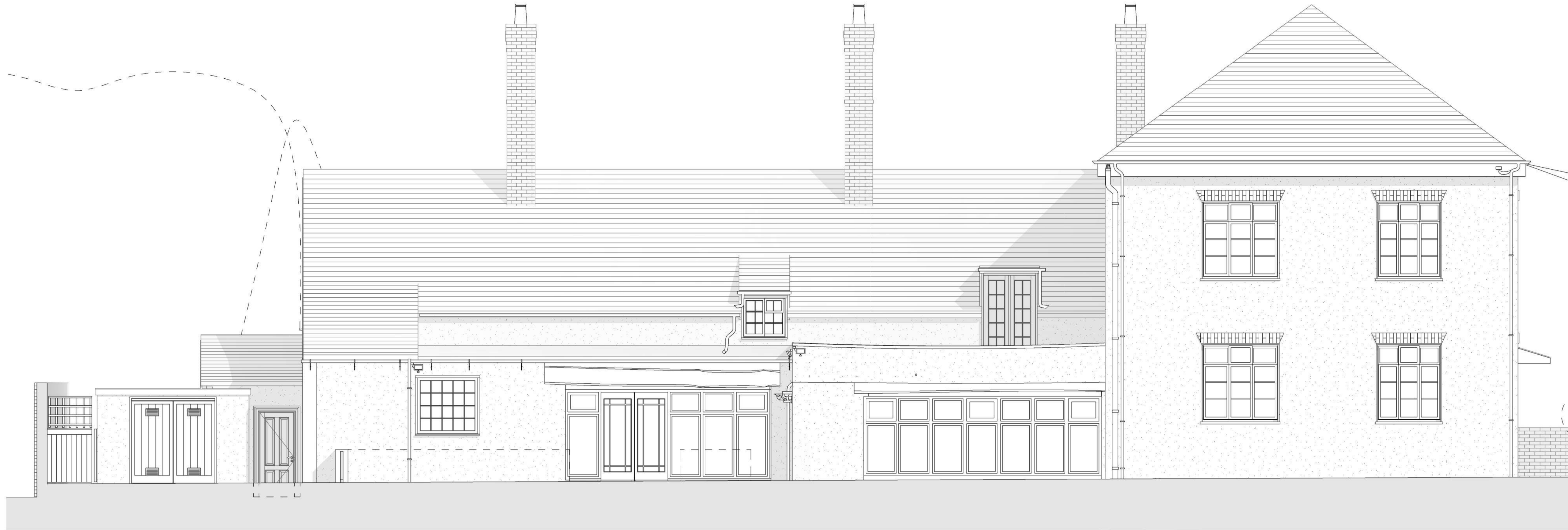
North East Elevation - Existing 1:50