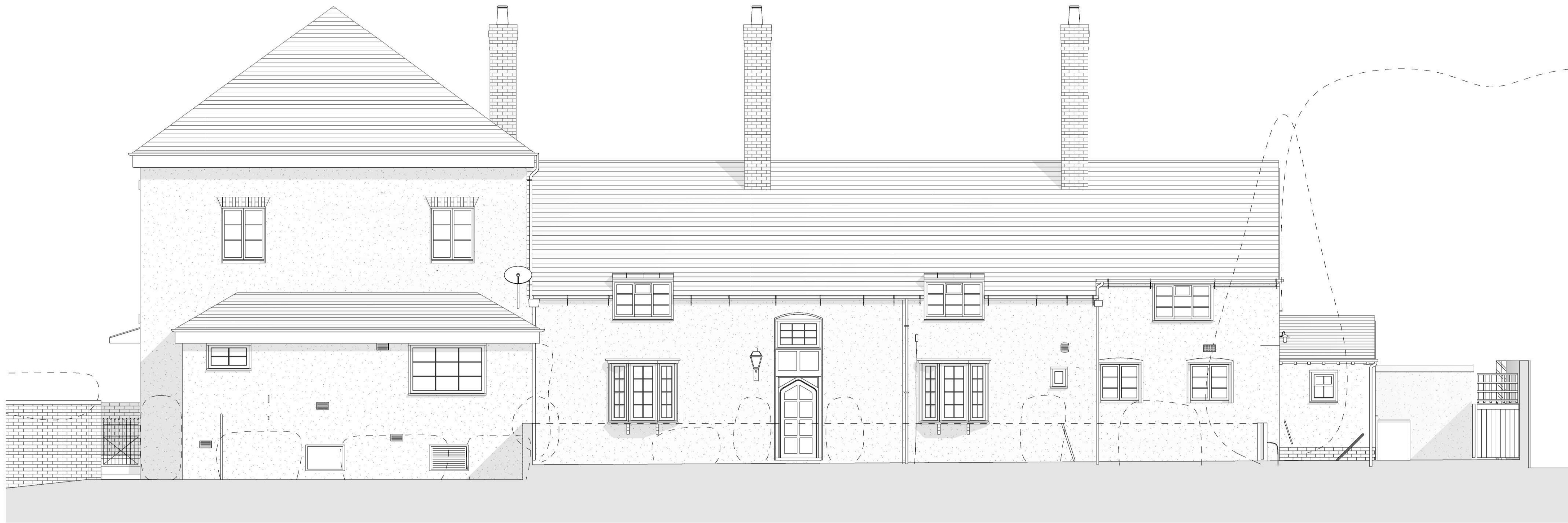
Southeast Elevation - Existing 1 : 50