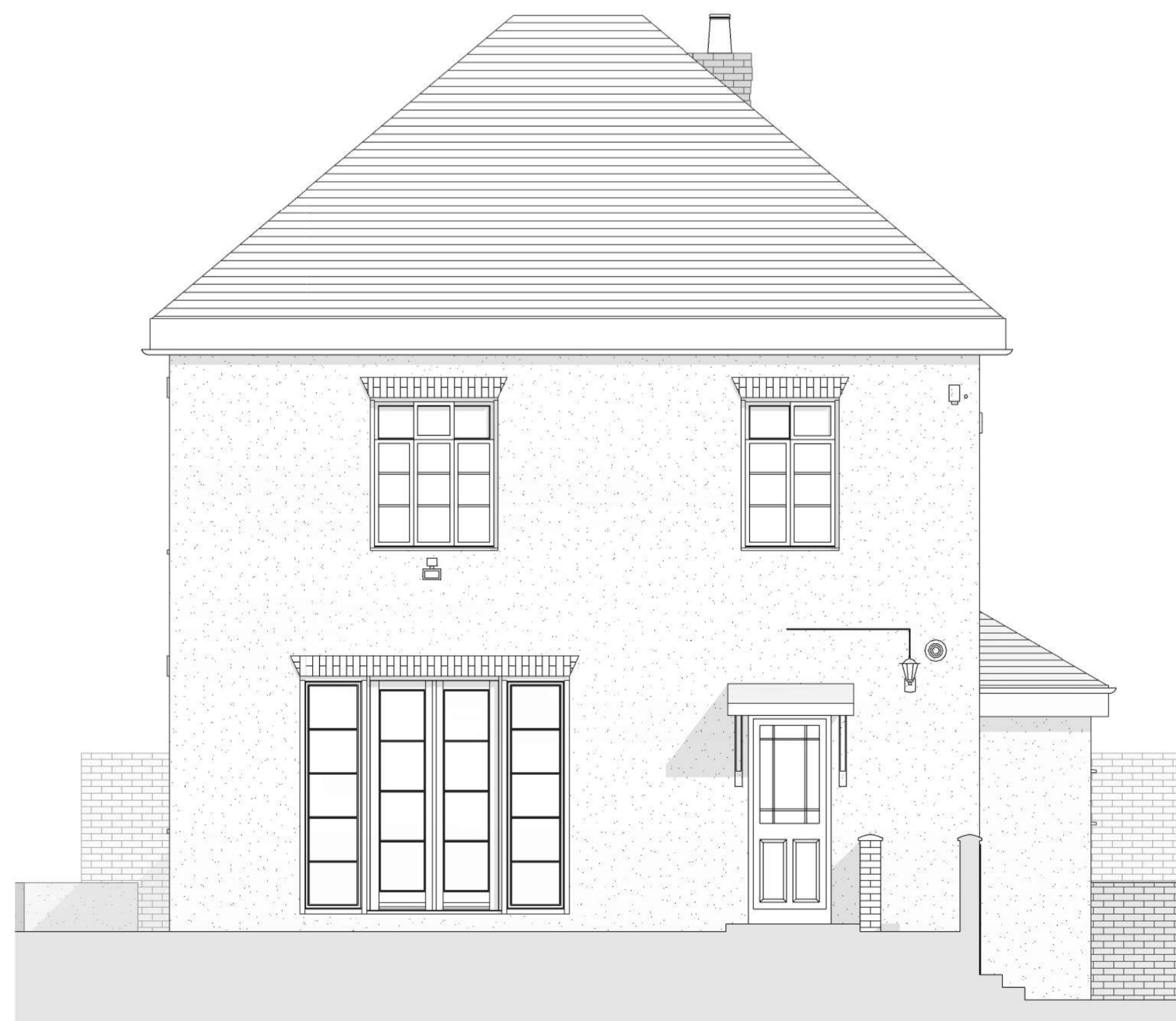
South West Elevation - Existing 1 : 50