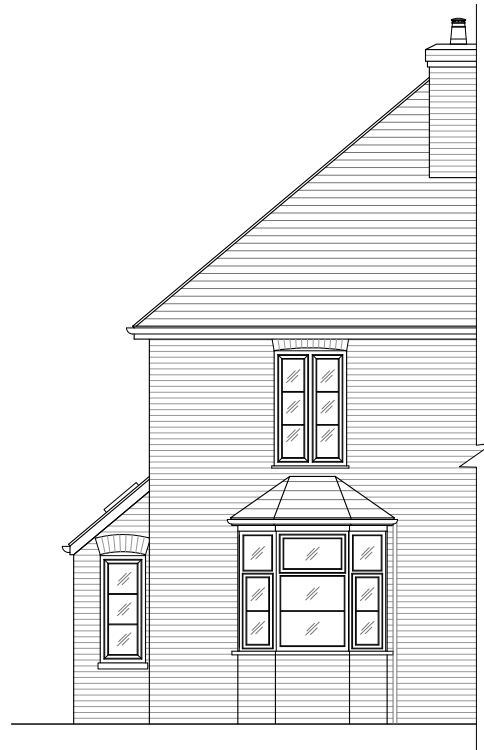
Front Elevation As Proposed