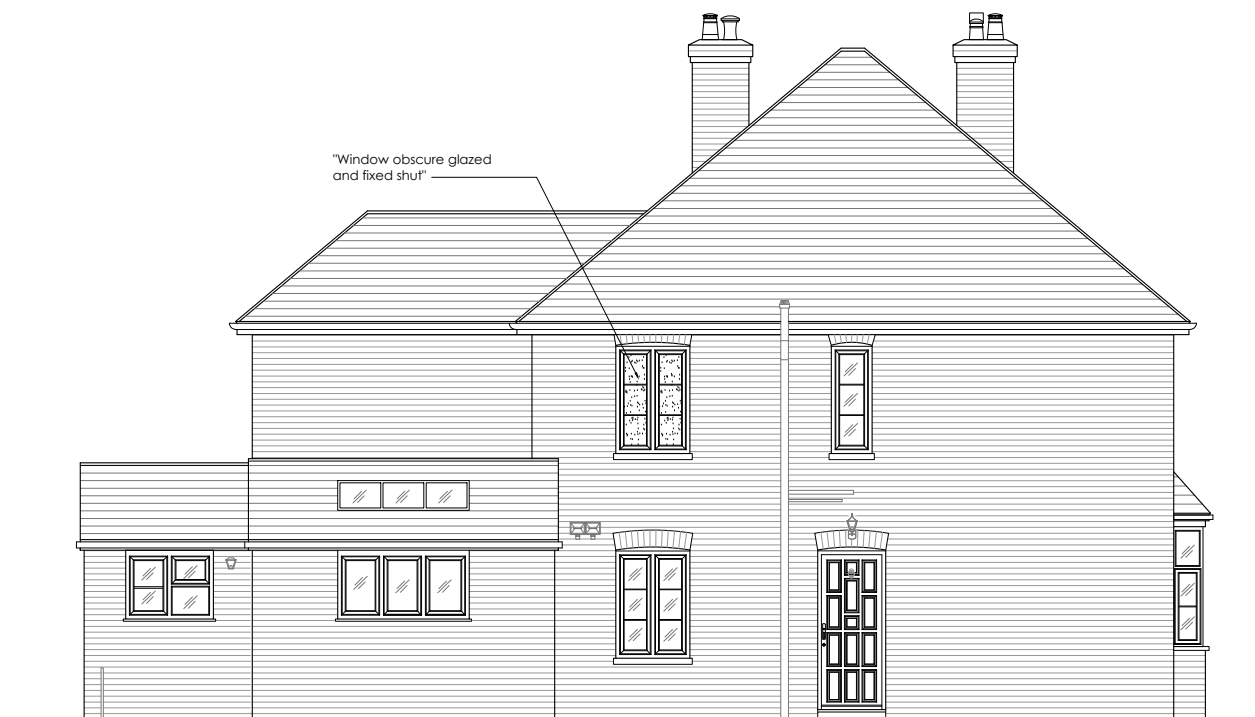
Left Side Elevation As Proposed