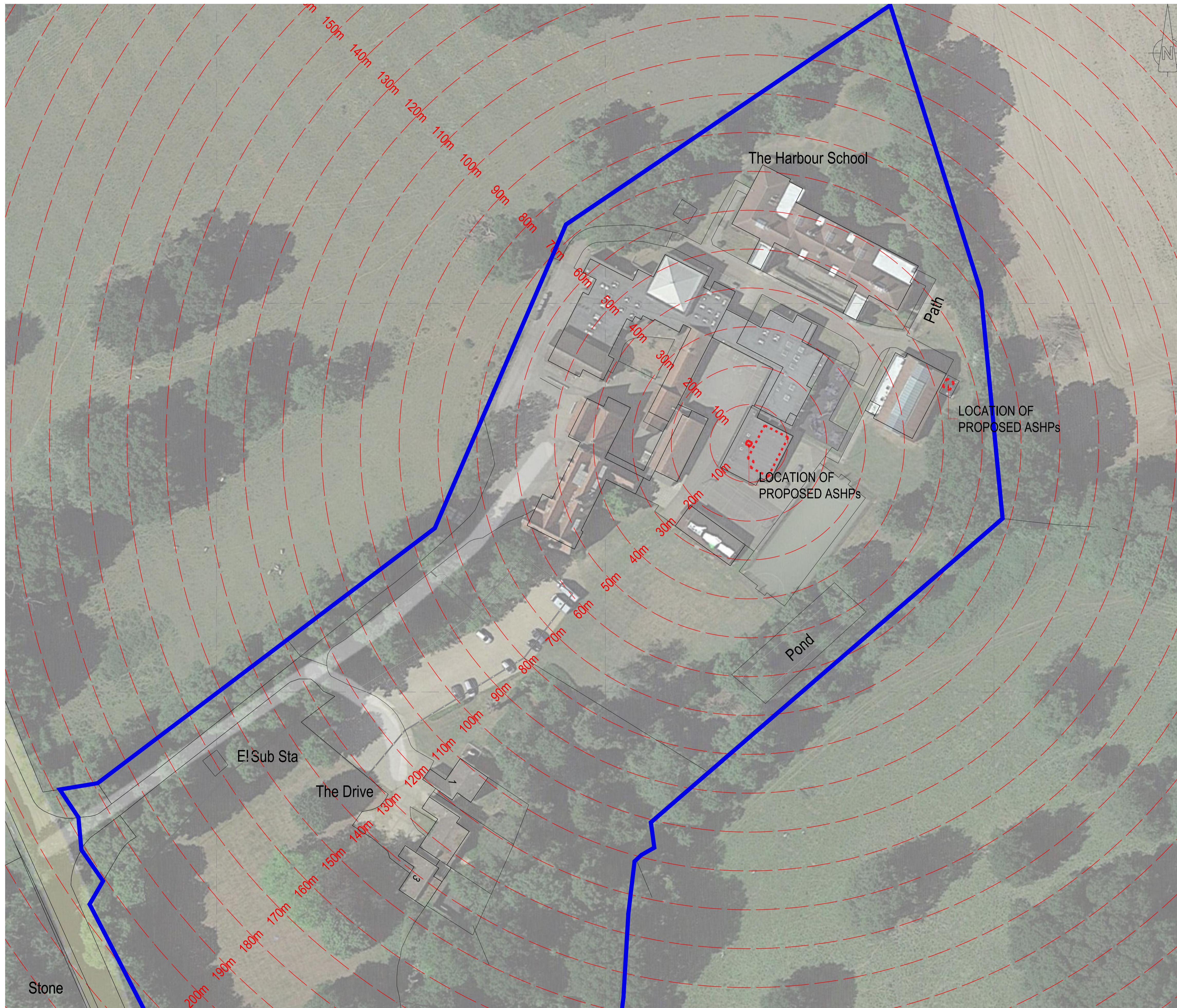
SITE PLAN SCALE 1:500 @ A1 - 1:1000 @ A3