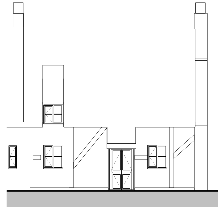
SW 1 : 100