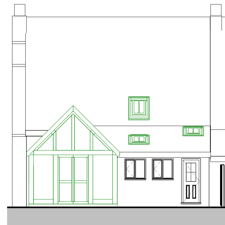
NE 1 : 100