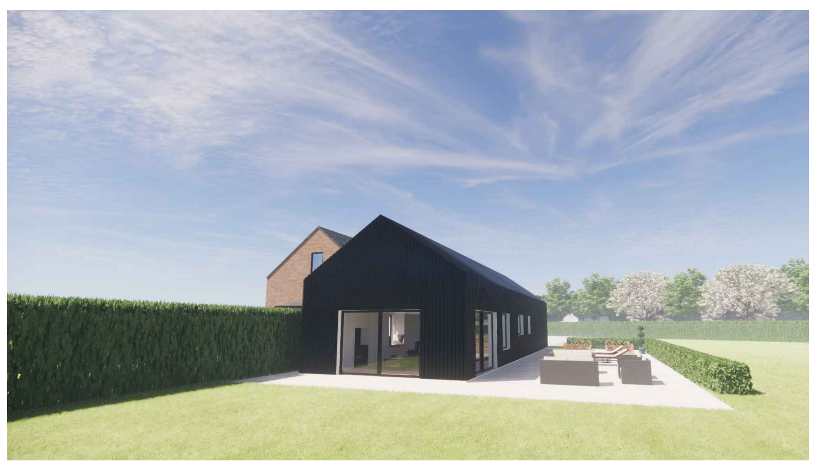
Proposed rear external view