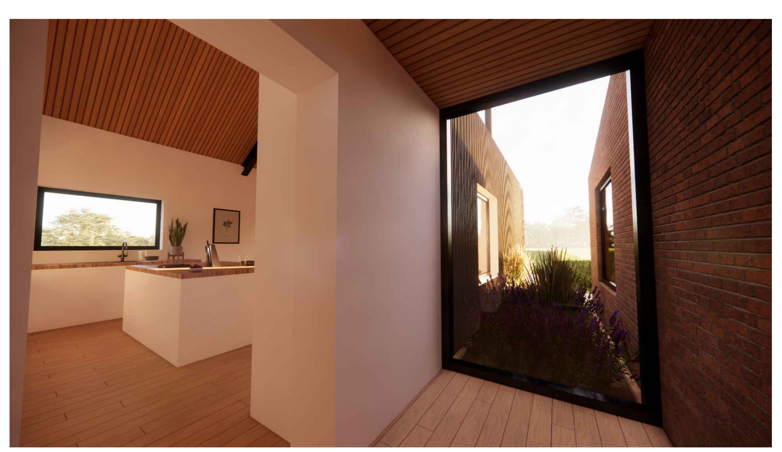
Proposed internal view from entrance looking out to courtyard garden