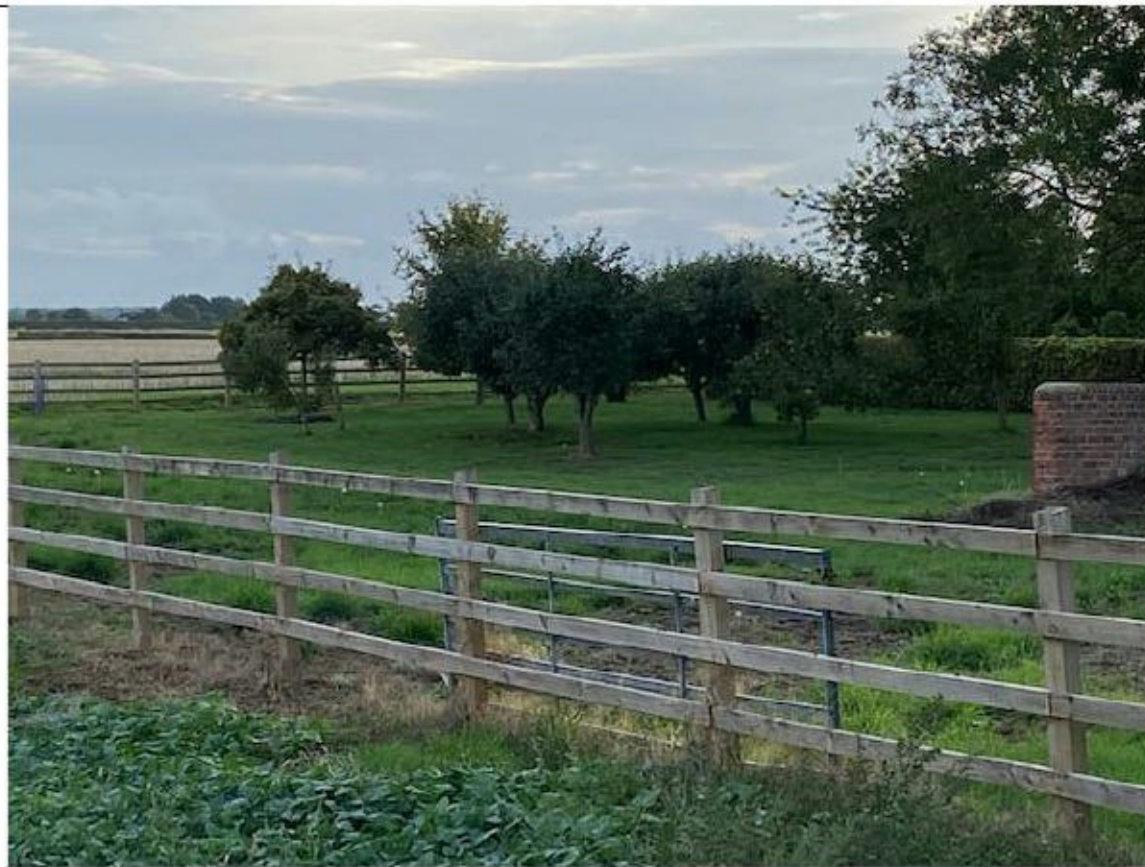
Photo 4 Existing Orchard- to be retained