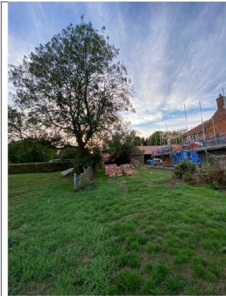
Photo 10 Existing Ash tree