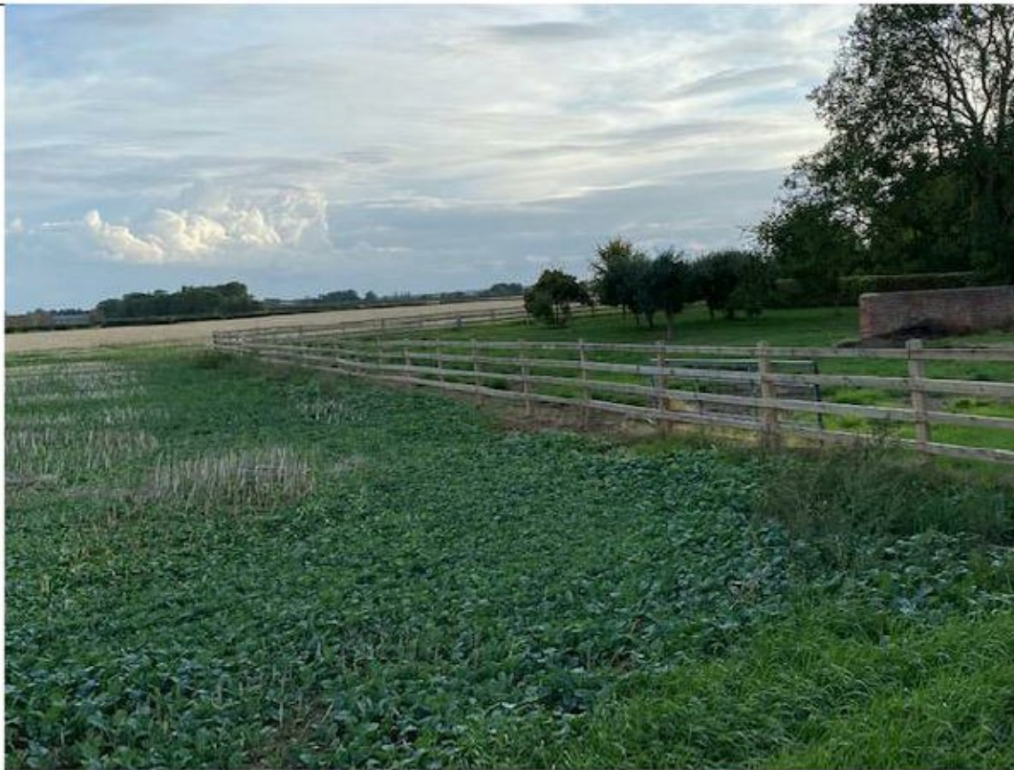
Photo 2 View towards the solar panel location towards the rear of the land fenced