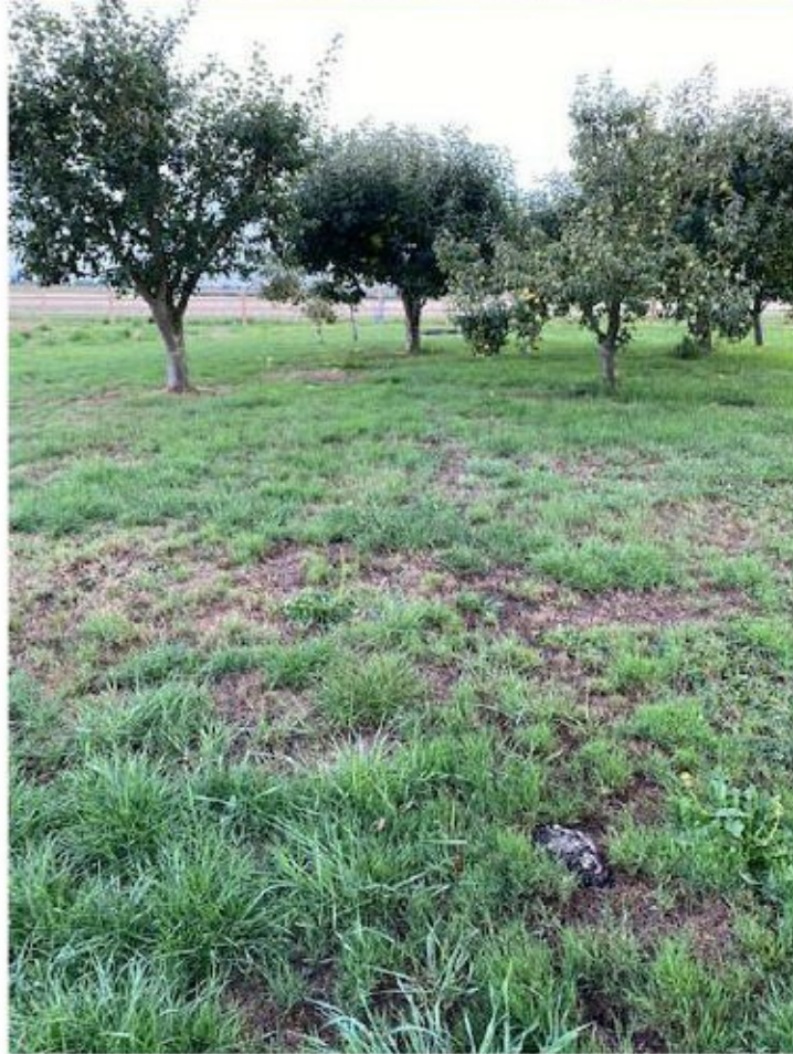
Photo 6 Ditto existing orchard trees retained