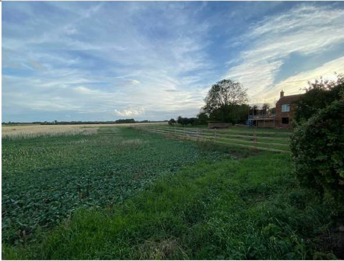
Photo 1 View of boundary from countryside